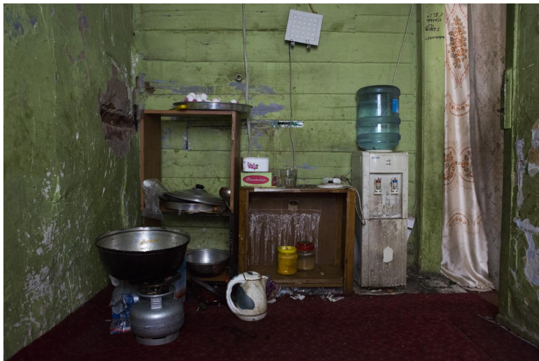
© ↑ The kitchen for 15 Afghan and Pakistani asylum-seekers living in Istanbul © Amnesty International

living in one small and partly underground room; two single beds, a table, and a refrigerator occupied virtually the entire space. 95