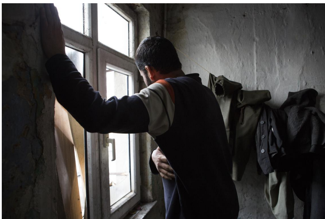
© ↑ An Afghan asylum-seeker looking out from his flat in Istanbul © Amnesty International

EU member states should be looking at activating such a scheme, in meaningful numbers, without delay.