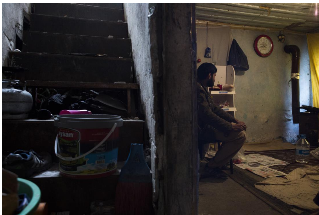
© ↑ An Afghan asylum-seeker living in Istanbul – Afghans have no realistic prospect of either being integrated in Turkey or resettled to another country © Amnesty International

This chapter discusses the second requirement for the return of asylum-seekers and refugees to Turkey under the EU-Turkey Deal, namely that people are able to access what are known as “durable solutions.” UNHCR has identified three possible ways in which this obligation can be met: repatriation (when safe to do so) to countries of origin, integration in host countries, and resettlement to third countries. In the absence, to date at least, of a large scale resettlement programme from Turkey, and with little prospect of safe return for Syrians, and indeed many other refugees, the question of the long-term status and attendant rights of persons in need of international protection becomes particularly important. Turkey’s ability to provide durable solutions to refugees is severely compromised, however, by the continuing denial of full refugee status to non-Europeans.