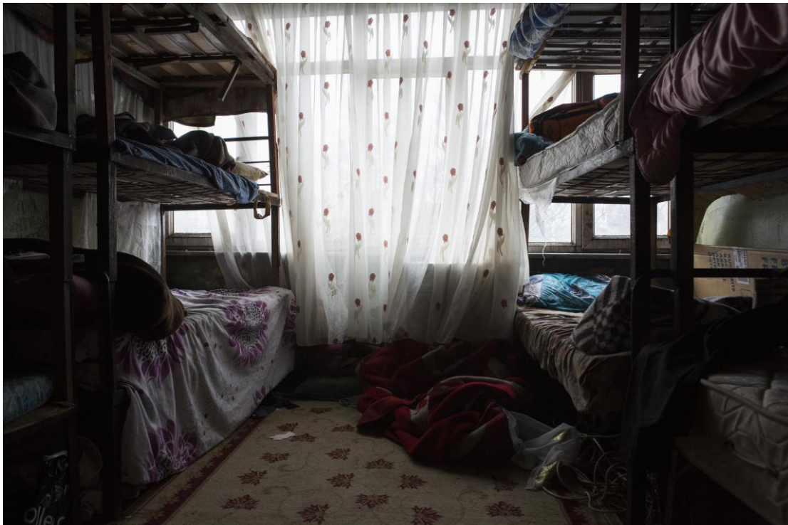
© ↑ About 12 asylum-seekers from Afghanistan lived in this room in Istanbul, below which was an industrial operation where the recyclable materials that they had collected from the garbage were weighed and sorted © Amnesty International

This chapter assesses whether Turkey meets the third criterion for effective protection: access to means of subsistence sufficient to maintain an adequate standard of living. With state authorities unable to meet people’s basic needs – in particular shelter – combined with the significant barriers that people experience in achieving self-reliance, the reality is that Turkey is failing to provide an environment where asylum-seekers and refugees can be guaranteed the ability to live in dignity.