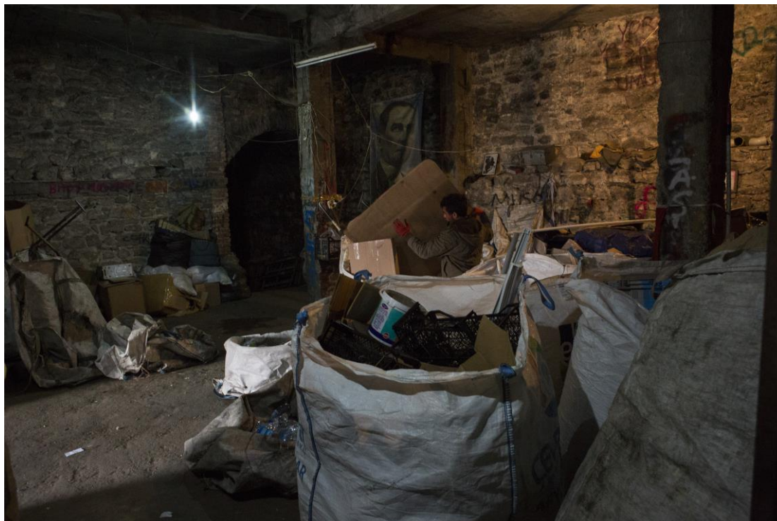
© ↑ Many Afghan asylum-seekers support themselves in Istanbul by selling recyclable materials they collect from garbage bins, which is later weighed and sorted in depots such as this operation © Amnesty International

irregularly. In the end, Ramin explained to Amnesty International, the police told the group of 11 to clean up a local park, but did not take action to deport them.