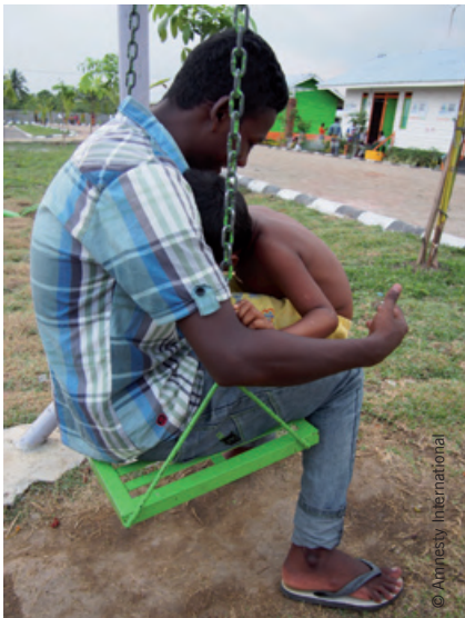
A Rohingya man and child at a shelter in Aceh.

In May 2015, Indonesia permitted the disembarkation of approximately 1,800 people in Aceh who had been stranded at sea in three boats. Of this group, UNHCR registered about 1,000 Rohingya asylum-seekers from Myanmar, 143 115 of whom spoke with Amnesty International. The remaining passengers were determined to be Bangladeshi migrants, and their gradual repatriation is being carried out with the assistance of IOM. As of 10 August 2015, the recently arrived Rohingya were being housed in five locations in Aceh and North Sumatra provinces: 315 in Lhokseumawe, 102 in Kuala Langsa, 159 in Lhok Bani, 331 in Bayeun, and 43 in Medan. 144