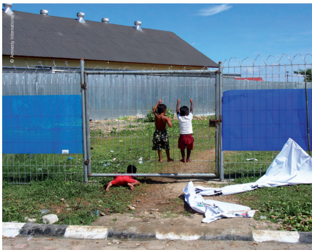
Three Rohingya boys at a shelter in Aceh.

A large proportion of the recently arrived Rohingya are children; of a population of 950 people, 521 – or 55% – are children, and 328 – or 34% – are unaccompanied or separated. 176 Although the sites where the Rohingya are living in Aceh are not officially called detention facilities, in practice the residents’ movements are often restricted and they could be understood as being detained. Amnesty International is concerned at the ongoing detention of any children, as detention is never in their best interests. 177 The long-term effects of immigration detention on children are well known; in one recent study, a third of children detained by Australia were suffering from a mental health disorder requiring psychiatric support. 178