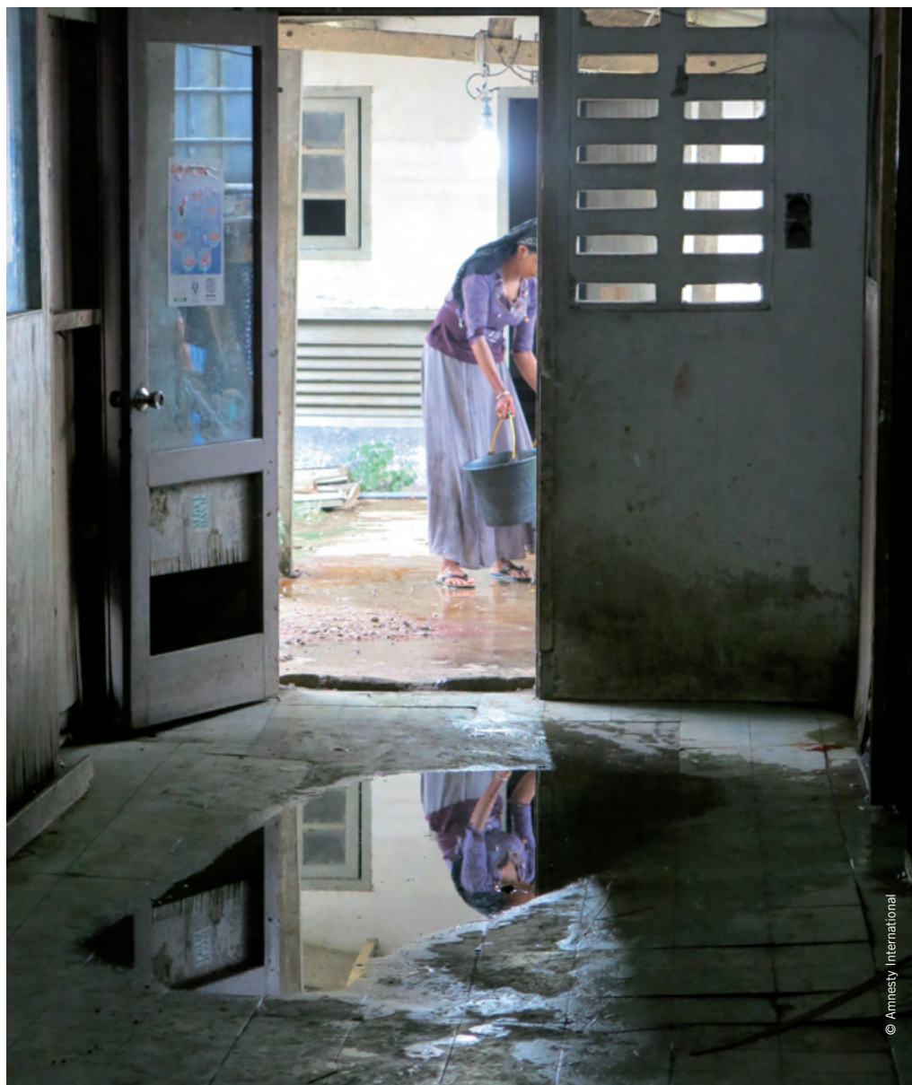
The hallway of the women's quarters at a shelter for Rohingya asylum-seekers in Aceh.

Several weeks after Amnesty International's research at the Blang Adoe shelter in Aceh, there were media reports about the beating and rape of the Rohingya by local residents. Following the alleged rapes, including of a 14-year old girl, more than 200 Rohingya left the shelter but eventually returned. At the time that this report was being finalized in mid-October 2015, local police said that they were investigating these reports. 181