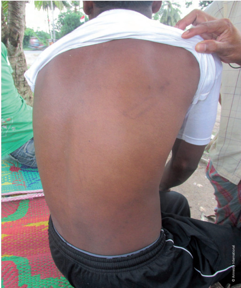
A 21-year old Bangladeshi man showing a scar he said he sustained from severe beatings on board a large vessel that stayed near the Thai coast for seven months.