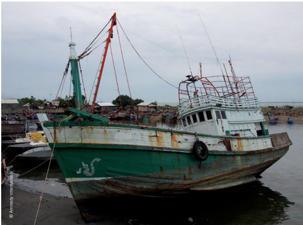
One of the three boats to reach Aceh in May 2015. It carried 578 Rohingya and Bangladeshi passengers, who were rescued by local fishermen.

In May 2015 three boats carrying 1,800 women, men and children grounded in Aceh in Indonesia. The vessels were among the many boats that had been abandoned by their crews following the regional crackdown on trafficking, leaving thousands of passengers stranded at sea for weeks. The majority of those on the boats were Rohingya who had fled Myanmar. All those who arrived at Aceh were weak with hunger, exhaustion and fear. They had endured weeks or months at sea, in boats controlled by ruthless people traffickers or abusive smugglers. This chapter discusses the conditions they were fleeing in Myanmar.