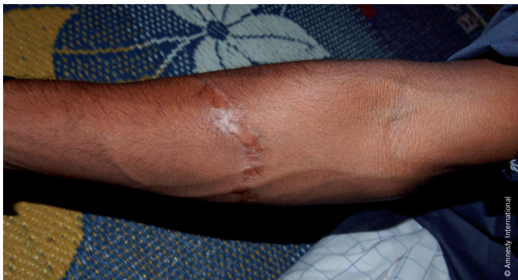
A Rohingya man showing a scar he said he sustained from a knife attack that took place in Myanmar in 2012.

Several interviewees said that their family members were killed and/or disappeared during the 2012 violence. A Rohingya businessman from Molek told Amnesty International that his 50-year old aunt was killed by police in June 2012; an eye-witness told him that she was stabbed with a knife in her side, and her body was taken to the monastery but never released to her family. At around the same time, his two teenage nephews were captured by a mob and never seen again. He called the police to inquire about his nephews' whereabouts, but the officer told him: " Kala , I cannot do anything for you." 31 A 19-year old woman from Sakki village said that in June 2012 her husband received knife wounds during the attacks, and she believes he died: "We cannot find his dead body. It disappeared." 32 A woman from Santolli village told Amnesty International that her eight- and seven-year old children disappeared during the June 2012 violence; she fears that they are dead, saying: "I never saw their bodies." 33