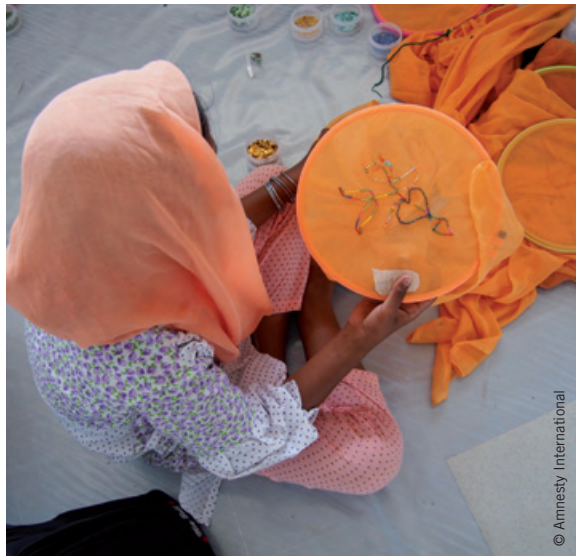
A Rohingya girl practising her embroidery at a shelter in Aceh.