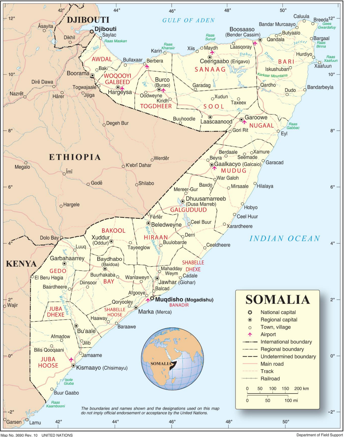
Map No. 3690 Rev. 10 UNITED NATIONS December 2011