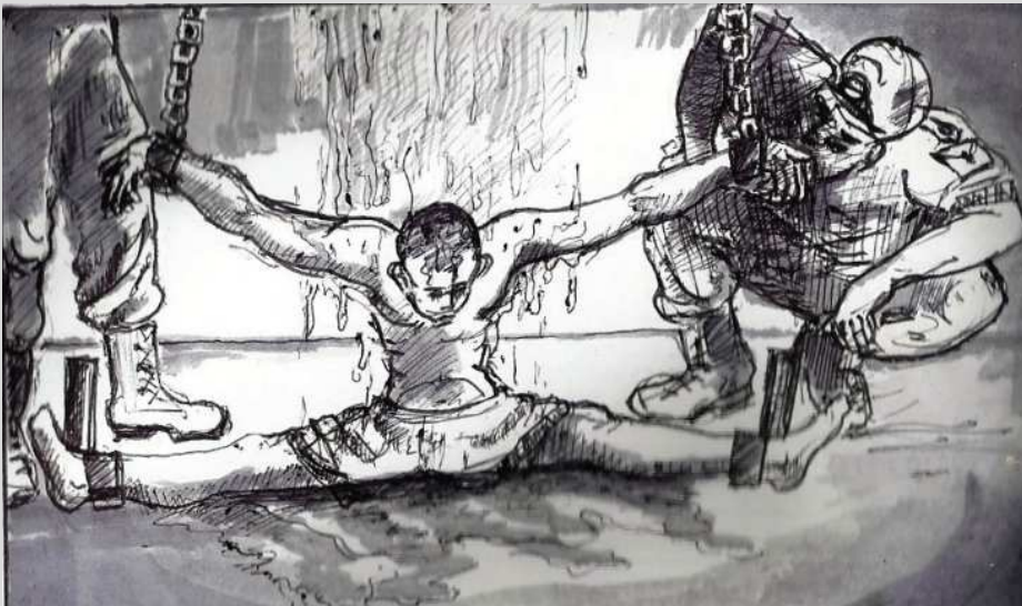
Figure 5 - An artist's drawing portraying 'water torture'. © Chijioko Ugwu Clement

Some former detainees have also described other forms of abuse that may violate the absolute prohibition of torture and other ill-treatment, including experiencing mock executions and being forced to watch other people being extrajudicially executed. As a result of increased scrutiny by human rights non-governmental groups, Nigerian human rights organizations have reported new methods of torture aimed at hiding visible marks on the body of victims. This include covering the ropes used in tying up suspects with cloth to avoid any mark on the body; and tying the upper arm of suspects with rubber to choke the flow of blood and covering detainees with plastic and placing them in the sun until they die.