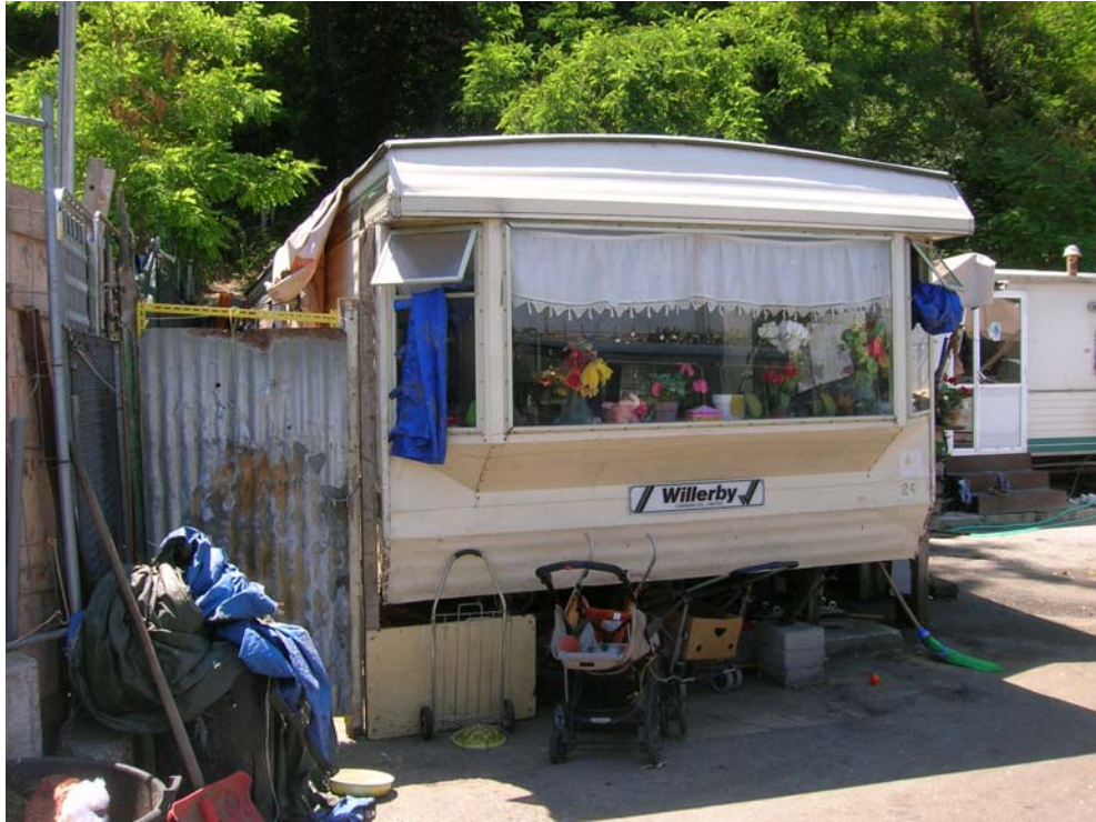
A mobile home in Candoni camp, Rome, June 2013. When the Casilino 900 camp was closed in 2010, about a hundred of its residents were transferred to Candoni, where a total population of almost 900 is currently housed.

Amnesty International urges the national government to progress with the implementation of the 2012 National strategy for Roma inclusion, in particular by taking measures to review the obstacles to Roma's access to social housing and to ensure their effective access (as foreseen under Specific Objective 4.1 of the National strategy).