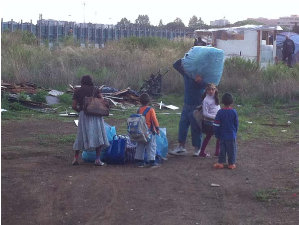
Forced eviction of families living in the informal camp of Via Salviati, Rome, 12 September 2013. Over 500 forced evictions were reported in Rome in the past five years.