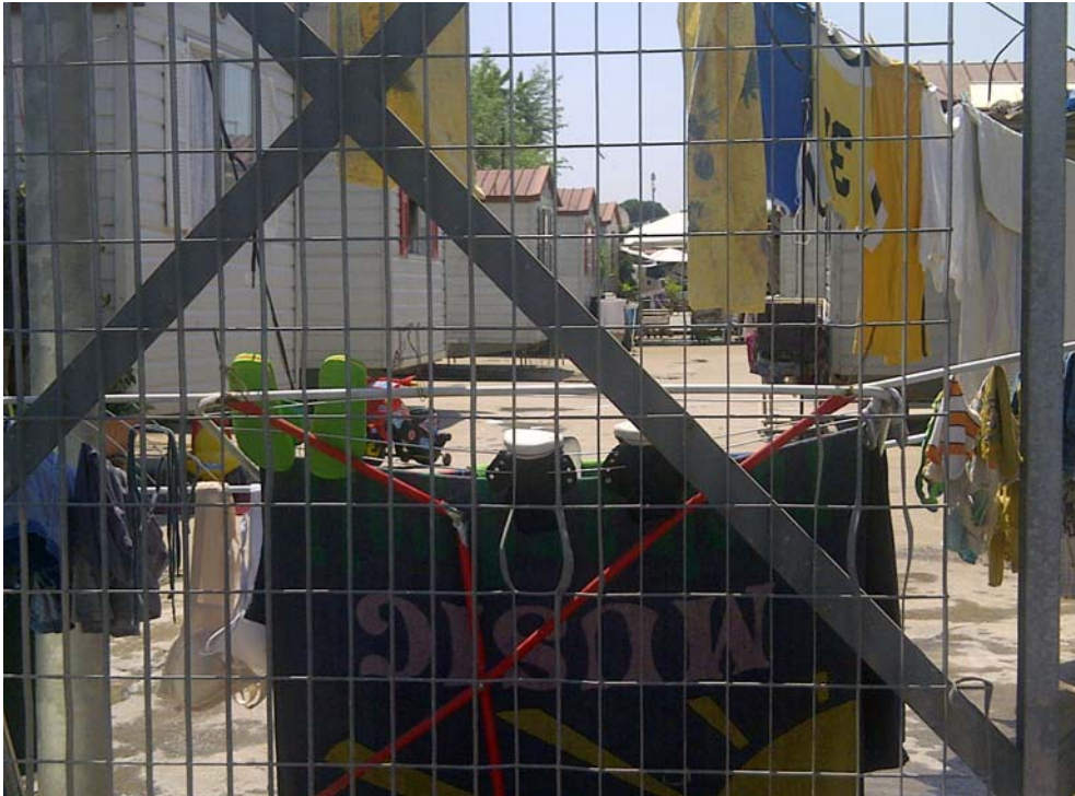
The authorized camp of Salone, Rome, 2013. According to official figures, about 900 people are housed in the camp, but it is estimated that the real number may be up to 30% higher. Tens of families were transferred to Salone by municipal authorities after being forcibly evicted from other camps, including Casilino 900 and La Martora, increasing overcrowding.