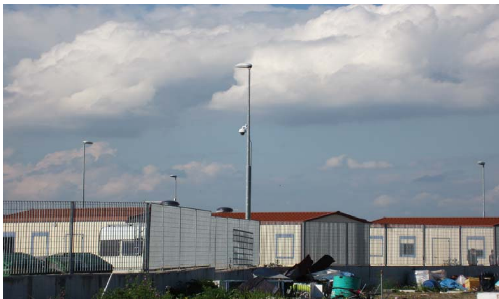
Nuova Barbuta camp, 2013. The camp was opened in June 2012 next to Ciampino airport, outside Rome, to host Roma previously living in other camps, including Tor de' Cenci. Fences run all around the camp, equipped with video-cameras pointing both outwards and inwards.

Heightening the sense of separation, fences run all around the camp, equipped with video surveillance pointing both outwards and inwards. The camp can only be entered and exited through a guarded gate. It can host up to 880 people in some 160 units – the biggest measuring 40m 2 . There are no trees or shaded areas. It is already surrounded by large areas of rubbish, which is an inevitable by-product of one of the very few ways Romani people find to earn a living, to recycle rubbish and sell any iron or other useful metal they find.