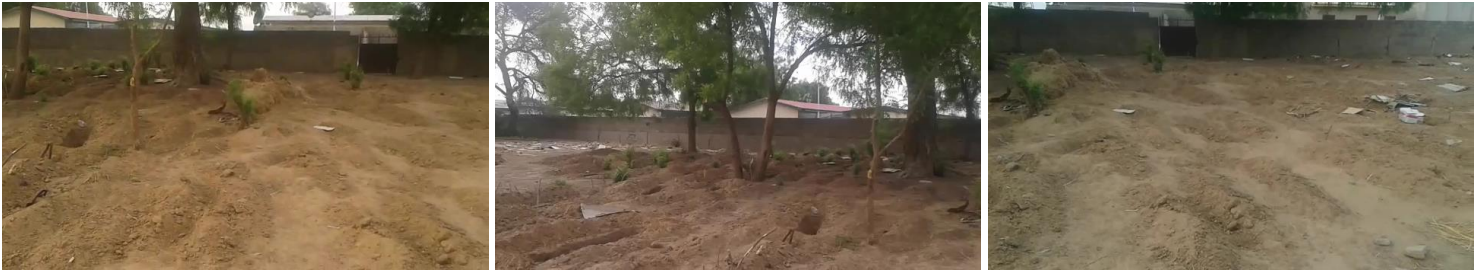
Recently disturbed earth by the southern gate of Gwange cemetery, Maiduguri. Witnesses saw BOSEPA staff bring bodies to the gate in a rubbish truck. These images show the likely site of grave. April 2016.

Mallam Babagana (not his real name) works by the side of the road a few hundred meters from the cemetery's southern gate. He told Amnesty International that since November 2015, a BOSEPA rubbish truck has visited the cemetery in the morning, two to three times a week.