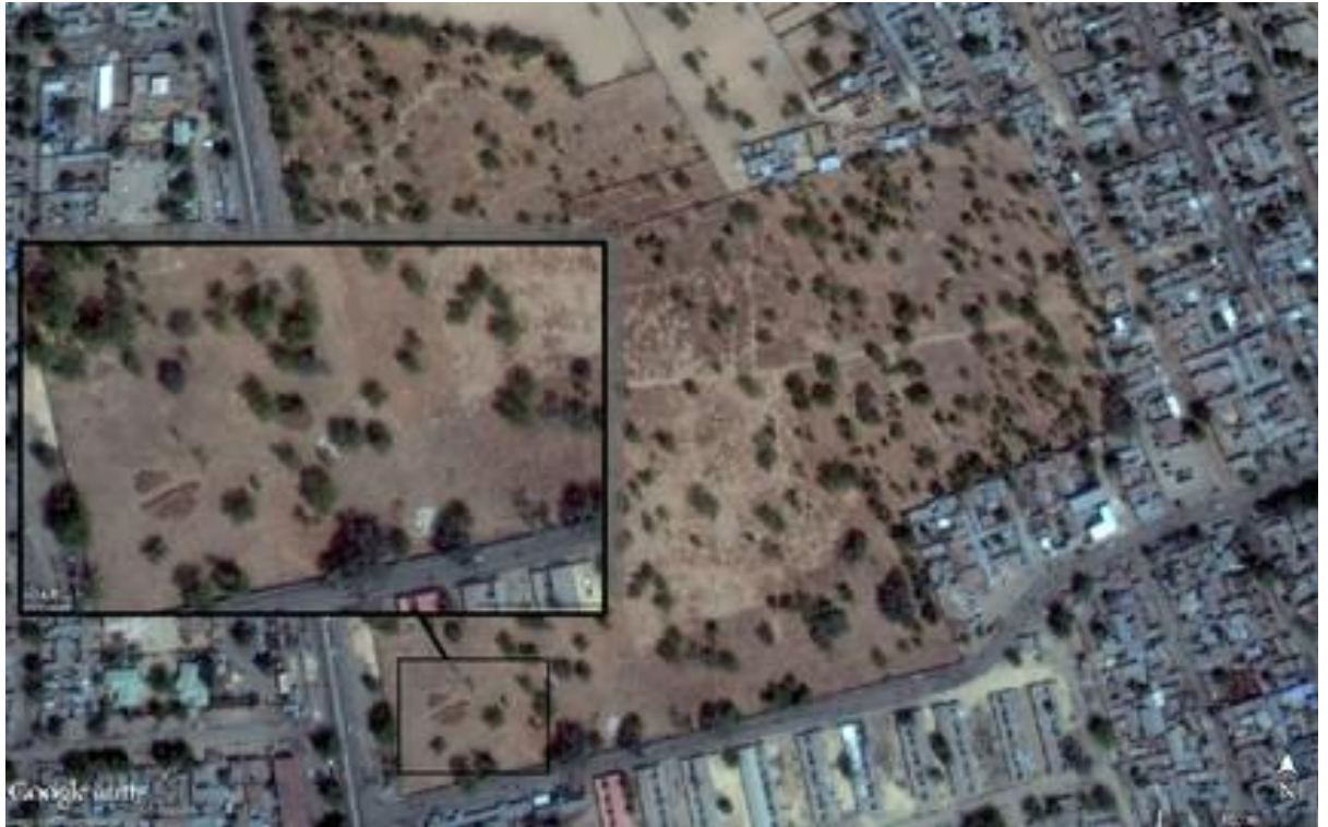
Gwange cemetery, Maiduguri. Imagery taken 6 March 2016.