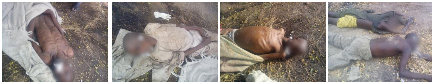
Corpses of detainees from Giwa Barracks, deposited at a mortuary in Maiduguri in February and March 2016.