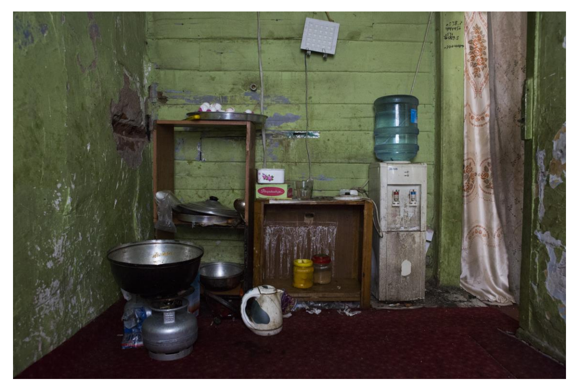
♠ The kitchen for 15 Afghan and Pakistani asylum-seekers living in Istanbul

living in one small and partly underground room; two single beds, a table, and a refrigerator occupied virtually the entire space.95