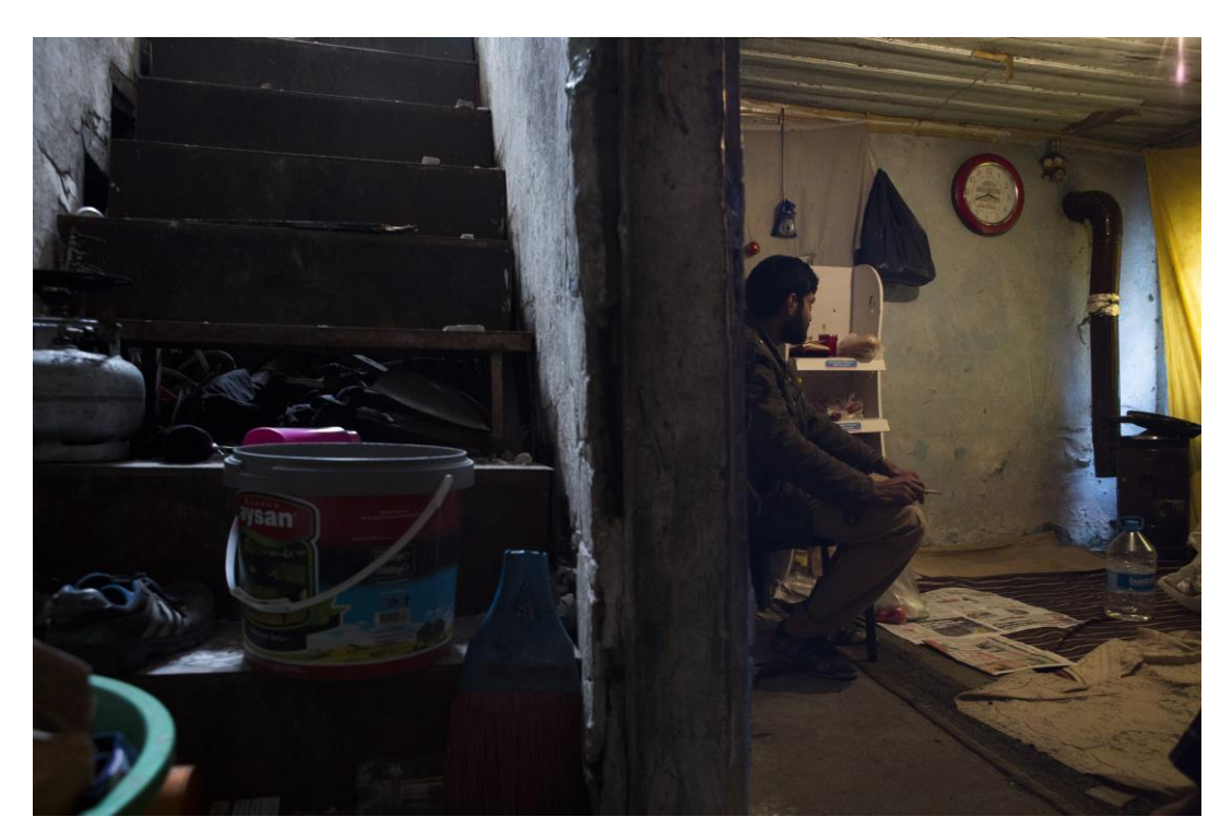
n An Afghan asylum-seeker living in Istanbul – Afghans have no realistic prospect of either being integrated in Turkey or resettled to another country n Amnesty International

This chapter discusses the second requirement for the return of asylum-seekers and refugees to Turkey under the EU-Turkey Deal, namely that people are able to access what are known as "durable solutions." UNHCR has identified three possible ways in which this obligation can be met: repatriation (when safe to do so) to countries of origin, integration in host countries, and resettlement to third countries. In the absence, to date at least, of a large scale resettlement programme from Turkey, and with little prospect of safe return for Syrians, and indeed many other refugees, the question of the long-term status and attendant rights of persons in need of international protection becomes particularly important. Turkey's ability to provide durable solutions to refugees is severely compromised, however, by the continuing denial of full refugee status to non-Europeans.