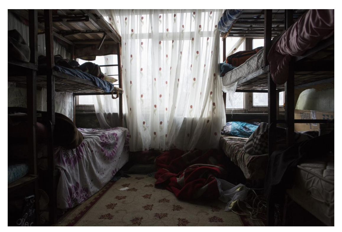
\textcircled{\circ} \uparrow About 12 asylum-seekers from Afghanistan lived in this room in Istanbul, below which was an industrial operation where the recyclable materials that they had collected from the garbage were weighed and sorted

This chapter assesses whether Turkey meets the third criterion for effective protection: access to means of subsistence sufficient to maintain an adequate standard of living. With state authorities unable to meet people's basic needs – in particular shelter – combined with the significant barriers that people experience in achieving self-reliance, the reality is that Turkey is failing to provide an environment where asylum-seekers and refugees can be guaranteed the ability to live in dignity.