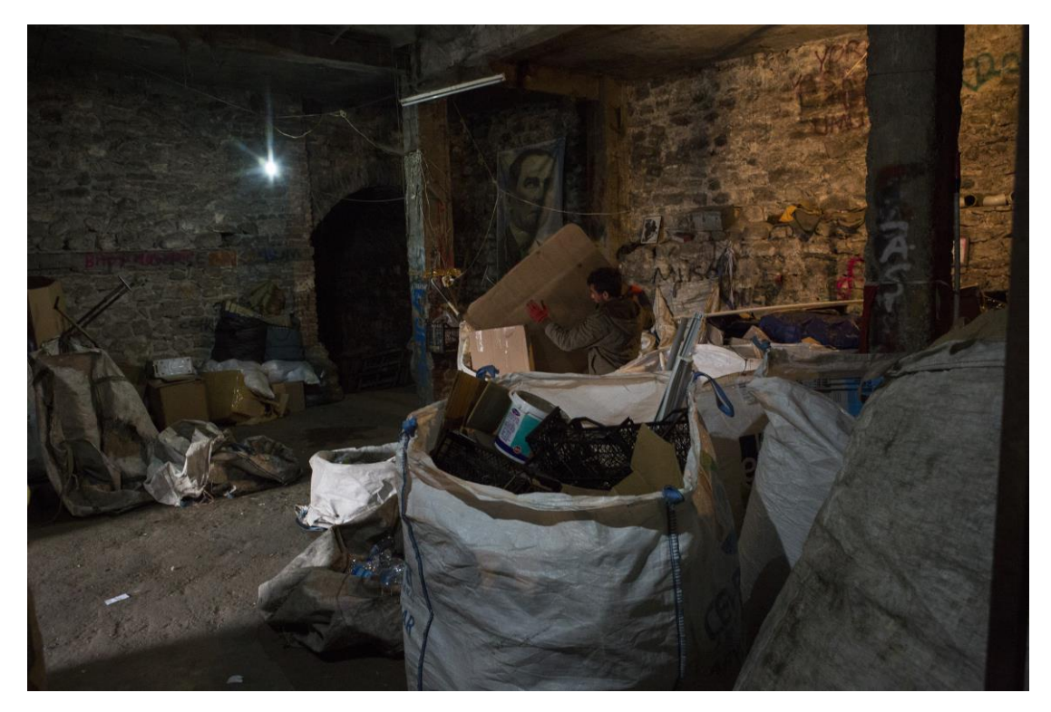
⊕ ↑ Many Afghan asylum-seekers support themselves in Istanbul by selling recyclable materials they collect from garbage bins, which is later weighed and sorted in depots such as this operation

irregularly. In the end, Ramin explained to Amnesty International, the police told the group of 11 to clean up a local park, but did not take action to deport them.