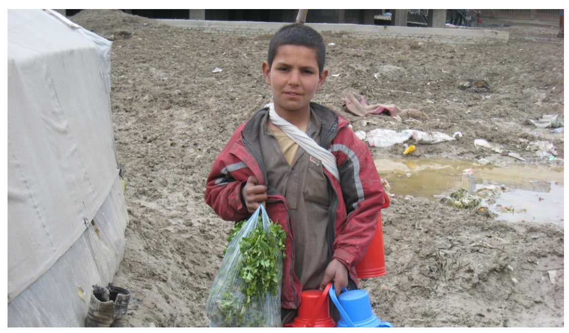
A 14-year-old boy in Charrahi Qambar settlement in Kabul, November 2015

Additionally, public hospitals only provide vaccinations and contraceptives free of charge, while other medicines must be bought from private clinics or pharmacies. While affording medicines is a struggle for many Afghans, it can be particularly difficult for displaced people who lack regular incomes and are often economically worse off than other urban poor (see more in section 4.5: Employment). Some displaced people reported having debts of several thousand Afs at private hospitals or pharmacies to buy medicines which they could not afford to pay back. One 55-year-old man in Naderabad camp in Mazar-e-Sharif said: