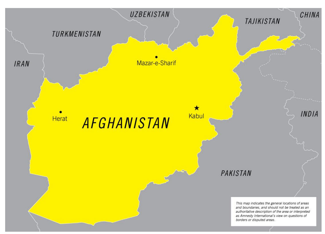
Map of Afghanistan, with the Herat, Kabul and Mazar-e-Sharif marked – the towns visited by Amnesty International for this report.