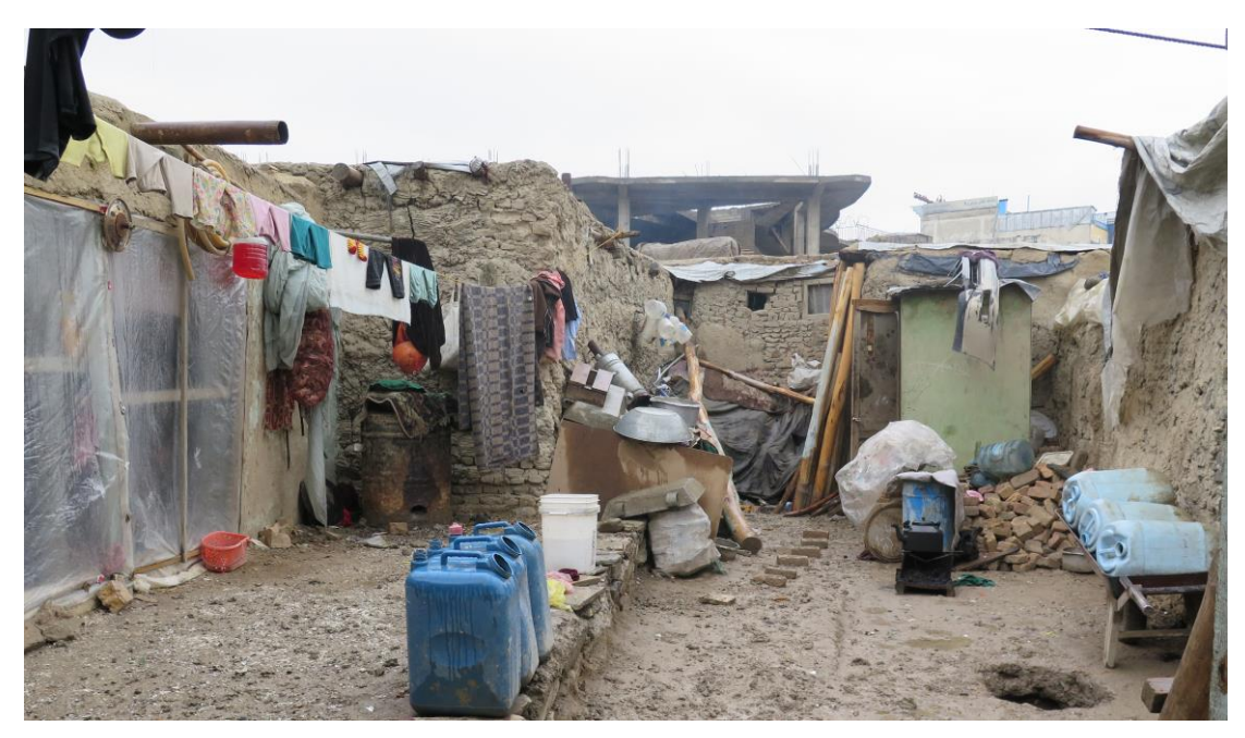
Chaman-e-Babrak settlement, Kabul, November 2015

Past attempts to allocate government land to displaced people or returnees in Afghanistan, as stipulated in Presidential Decree 104 (December 2005), have been largely ineffective and riddled with corruption. The land has often been barren or unfit for agriculture and too far away from services and employment opportunities. The land has often been barren or unfit for agriculture and too far away from services and employment opportunities.