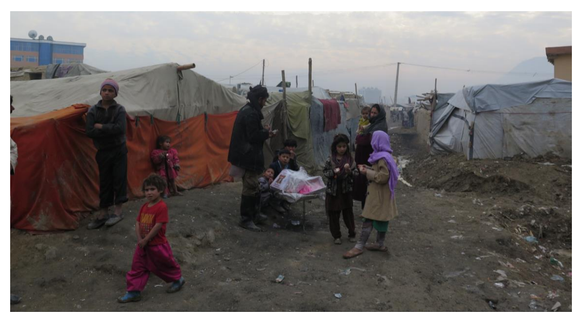
Residents of Chaman-e-Babrak settlement in Kabul, November 2015

The final policy, officially the National Policy on IDPs in Afghanistan, was endorsed at a meeting of the Council of Ministers on 25 November 2013 and launched by the Afghan government on 11 February 2014.