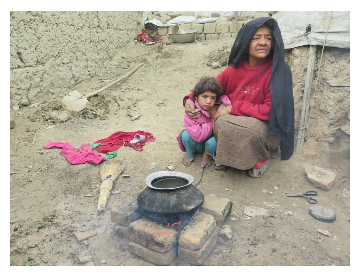
A displaced woman with her daughter in Kabul, November 2015