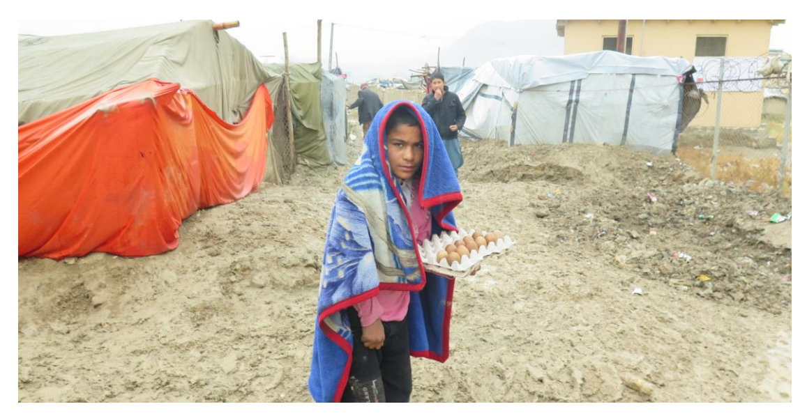
A 15-year-old boy in Kabul selling eggs at the local market to make a living. November 2015.

building townships and roads, which is the mandate of other ministries. According to MoF officials, the MoRR failed to submit credible proposals for meeting the needs of displaced people in the 2016 budget because of "low capacity" and because "there is no mention of IDPs in [the MoRR's] budget request".95