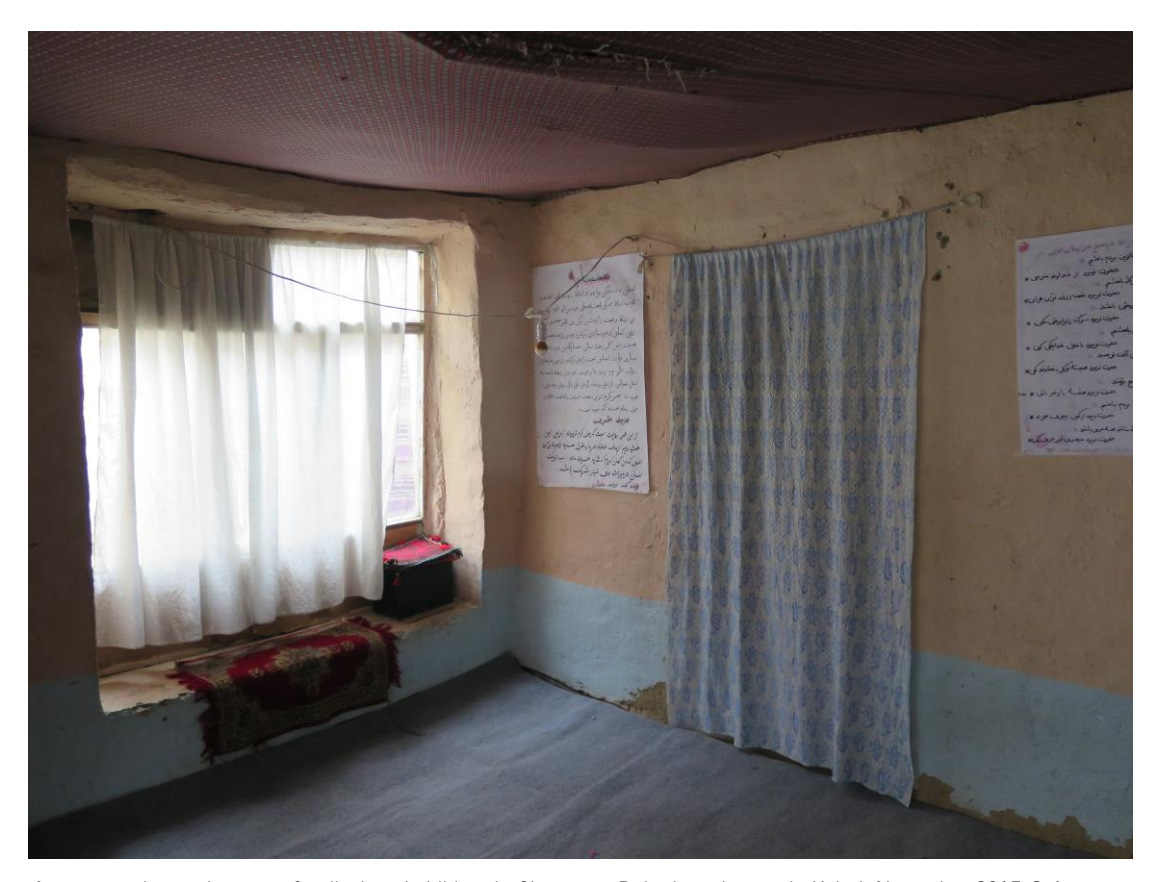
A room used as a classroom for displaced children in Chaman-e-Babrak settlement in Kabul, November 2015

There is also much recent evidence that displaced women and girls find it particularly difficult to access education. A comprehensive 2014 study by the NRC and The Liaison Office found that young displaced women and girls are often forbidden from leaving their homes by male relatives, making attending school–extremely difficult. The isolationism facing women and girls contributed to a sense of desperation and hopelessness, with the study reporting serious mental trauma among interviewees.<sup>218</sup>