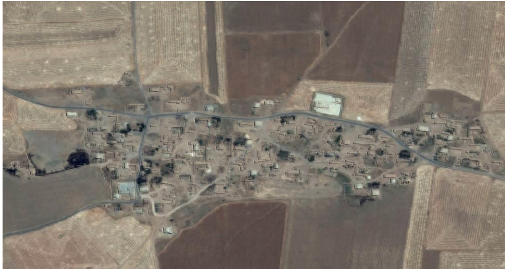
Satellite imagery the village of Husseiniya taken on June 2014.