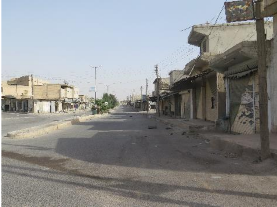
The town of Suluk to which residents have not been allowed to return, 30 July 2015.

A 91-year-old man from al-Ghbein who suffered from heart disease complained to Amnesty International that the YPG told him he had to leave the village, which was cut off from electricity and water. He said that he wanted to travel to Turkey where his wife and children were living, but that he was denied entry three times at the border. "I am hungry and thirsty," he said. He had nowhere else to go. 51