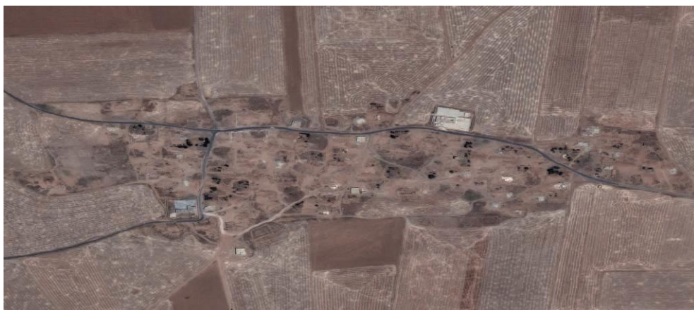
Satellite image of the village of Husseiniya taken on June 2015 reflects that almost the entire village has been razed.

Residents said that the village came under the control of the Free Syrian Army (FSA), an armed opposition group, in February 2013. A local Arab official from the Tel Hamees countryside said that the YPG first clashed with the FSA and other non-state armed groups in the Tel Hamees countryside in December 2013, and that the biggest confrontation between the FSA and the YPG took place in the village of Husseiniya in February 2014. 3 The official said that at that time, a number of armed groups, including Ahrar al-Sham, Liwa' 114,