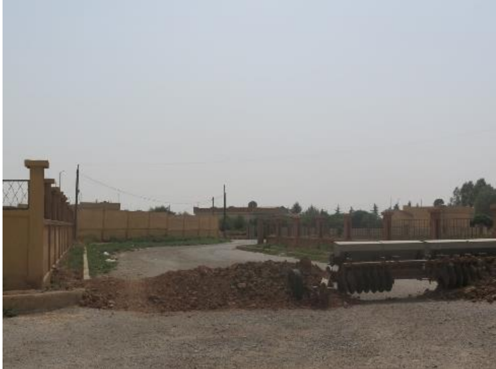
The entrance to Hammam al-Turkman blocked by a barrier placed by the Autonomous Administration, 30 July 2015.

In the nearby village of Hammam al-Turkman residents were gathered into the local school by the YPG and told they had to leave the area.