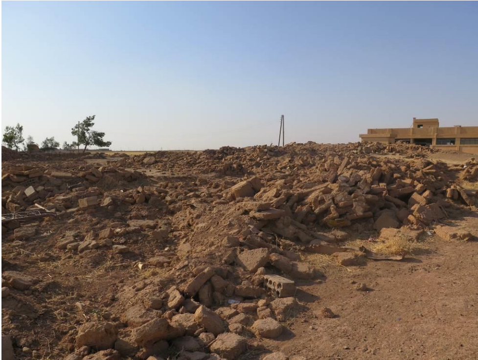
Some of the homes that were demolished in the village of Husseinia.

Amnesty International visited the Arab village of Husseinia in the Tel Hamees countryside in early August 2015. Villagers told Amnesty International researchers that nearly 90 homes in the village had been demolished, leaving only a single home still standing, and Amnesty International researchers saw the ruins of the destroyed homes during their visit. Satellite imagery of the village of Husseinia taken in June 2014 and June 2015 analysed by Amnesty International reflect that 225 buildings were standing in 2014, but that only 14 remained in 2015, a 93.8% reduction in one year. The destruction reflected in the satellite imagery is not consistent with shelling but rather the demolition of the village. Residents said the YPG carried out the demolitions in February 2015, displacing most residents to nearby villages and to the city of Qamishli. Some Husseinia residents remained in the village, living in a school that had not been destroyed.