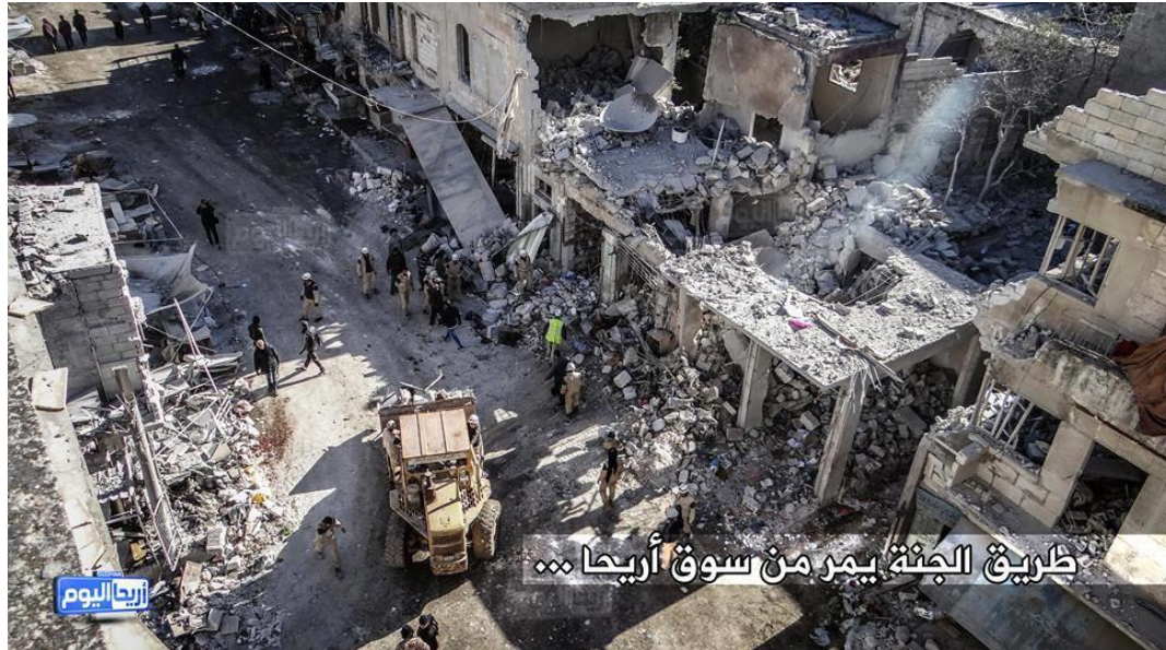
Damage to Ariha market area after 29 November 2015 air strike © Muhammad Qurabi al-Ghazal.

A second activist, “Abu Diab” 39 , told Amnesty International: