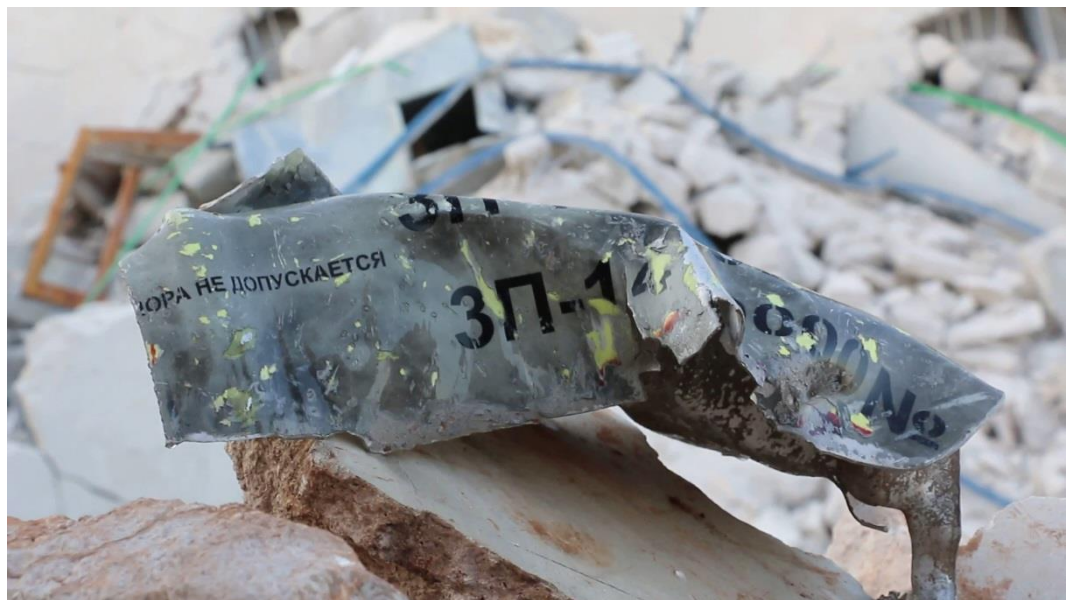
Remnant of Russian Kalibr cruise missile.