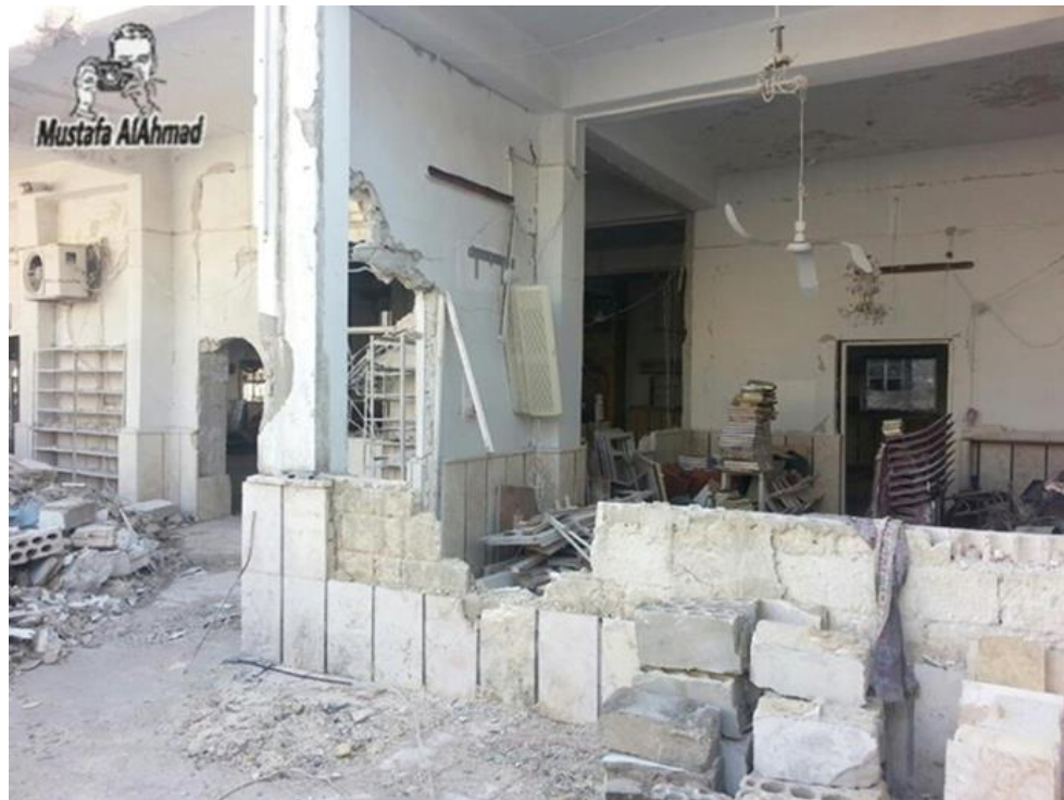
Image of the Omar Bin al-Khattab mosque in Jisr al-Shughour, which was hit by an air strike on 1 October 2015 © Mustafa al-Ahmad.

On 1 October 2015 a Russian Ministry of Defence spokesperson stated that Russia's air force had targeted IS infrastructure and had destroyed one such command post in Jisr al-Shughour. 23 On 30 October, following the emergence of reports and images showing that the Omar Bin al-Khattab mosque had been destroyed, Colonel-General Andrey Kartapolov stated that such information was a "hoax" and presented a satellite image claiming that the mosque was still intact. 24 However, the satellite image showed a different mosque, not the one destroyed in the attack.