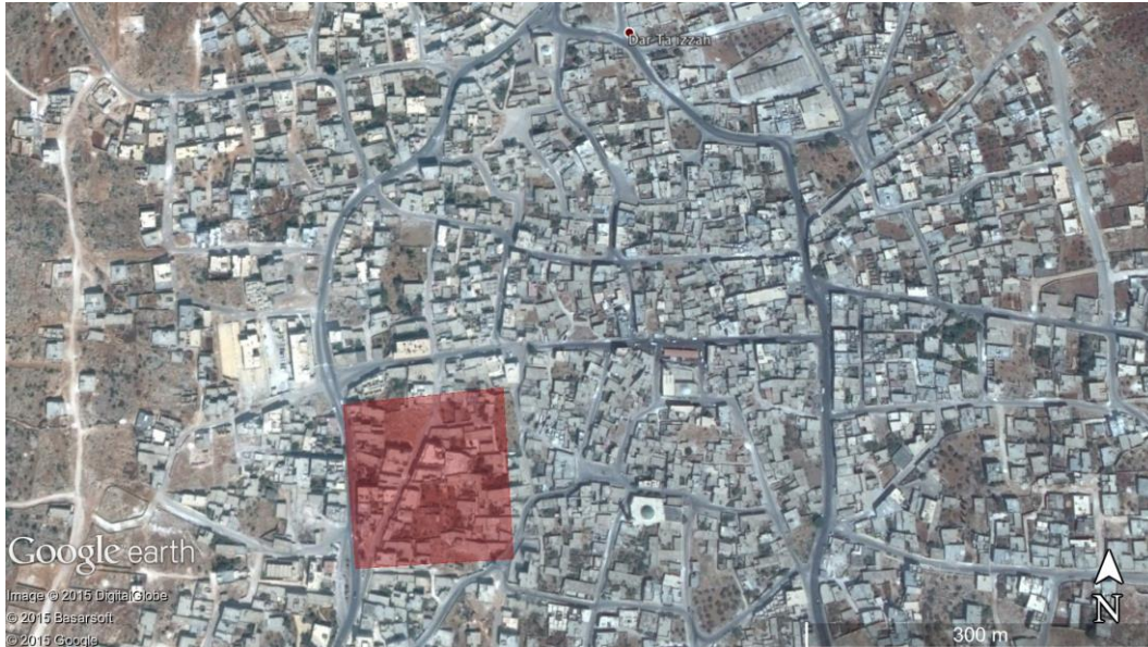
Approximate impact location (in red) of suspected Russian cruise missile strike in Darat Izza on 7 October 2015. Imagery date: 25 August 2014. Coordinates: 36.281051, 36.849916

Five civilians, including two women, four of whose names have been obtained by Amnesty International, were killed on 7 October 2015 when a suspected Russian sea-launched cruise missile struck residential buildings in Darat Izza, Aleppo governorate. More than six residential buildings with at least a dozen homes were destroyed by the attack according to an eyewitness interviewed by Amnesty International as well as reports of human rights organizations. Information provided by local human rights defenders, Syrian human rights organizations and video clips of the aftermath of the attack reviewed by Amnesty International indicated that there was widespread destruction and damage but no military casualties nor any armed presence in the town. 25