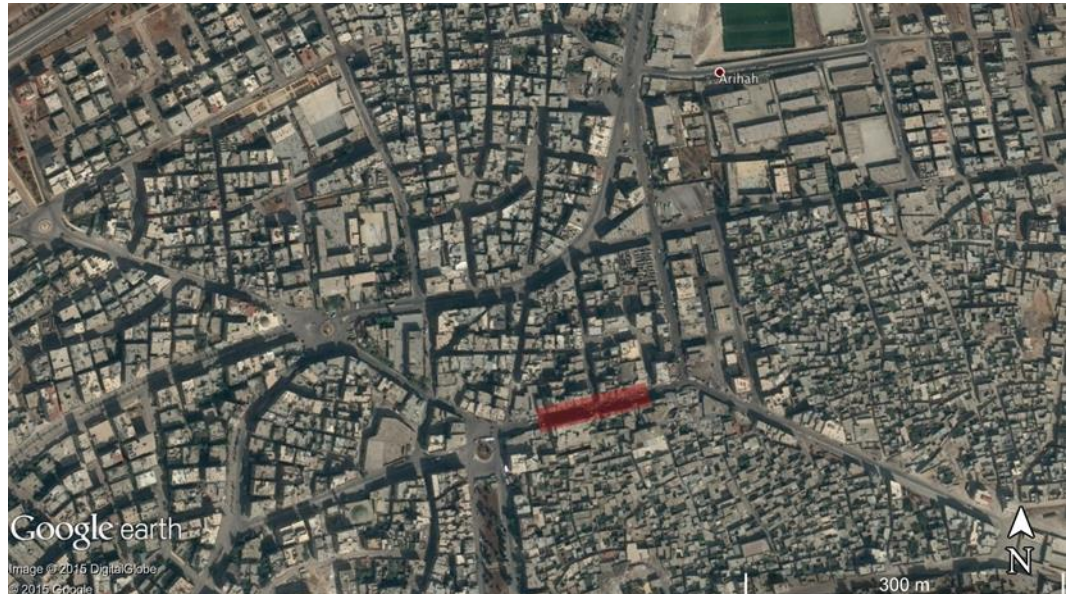
Impact location (in red) of a suspected Russian air strike on a market in Ariha on 29 November 2015. Imagery date: 23 September 2014. Coordinates: 35.813144, 36.610613

Amnesty International is not aware of any statement by the Russian authorities acknowledging or denying responsibility for this attack despite several reports claiming that Russian forces were behind it, including one by Human Rights Watch. 34