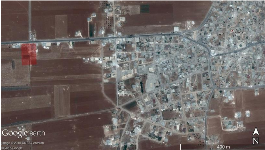
Area outside Maasran where unexploded cluster submunitions were found (in red) following a suspected Russian air strike on 6 October 2015. Imagery date: 18 June 2014. Coordinates: 35.706833, 36.791472

Amnesty International has also seen accounts, including a video clip, of civilian casualties from attacks purportedly involving cluster munitions at the Nuqeyr camp for internally displaced people in Idleb on 8 October. 54 On the night of 12/13 November, Russian forces are suspected of delivering ZAB2 5S incendiary bomblets via RBK-500 cluster munition bombs in attacks near Maaret Numan, Idleb governorate. According to statements from local activists, the attacks appear to have been carried out in connection with other air strikes on a nearby olive oil press and a bakery. 55 Amnesty International is continuing to look into reports that cluster munitions delivered by Russian-made multiple rocket launcher systems may have involved Russian forces.