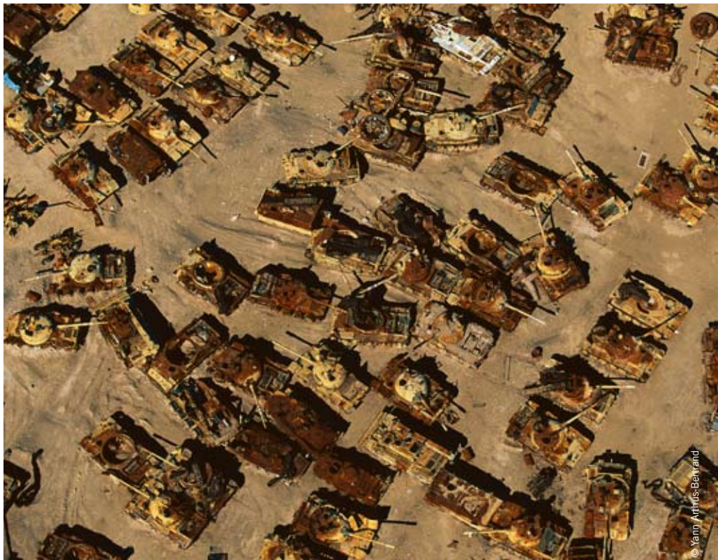
Iraqi tank junkyard in the desert near Al-Jahrah, Kuwait, January 1991.

President Hussein built up an indigenous arms industry, producing small arms and ammunition, modelled on the Russian AK series, Russian T-72 tanks under licence, howitzers, anti-tank grenade launchers (RPG-7) and Beretta-type pistols. According to Jane's Sentinel Security Assessment, by 1990 the country "was largely self sufficient in the production of small arms ammunition, rocket propelled grenades (RPG) [sic], mortar and artillery shells and aircraft bombs". 85