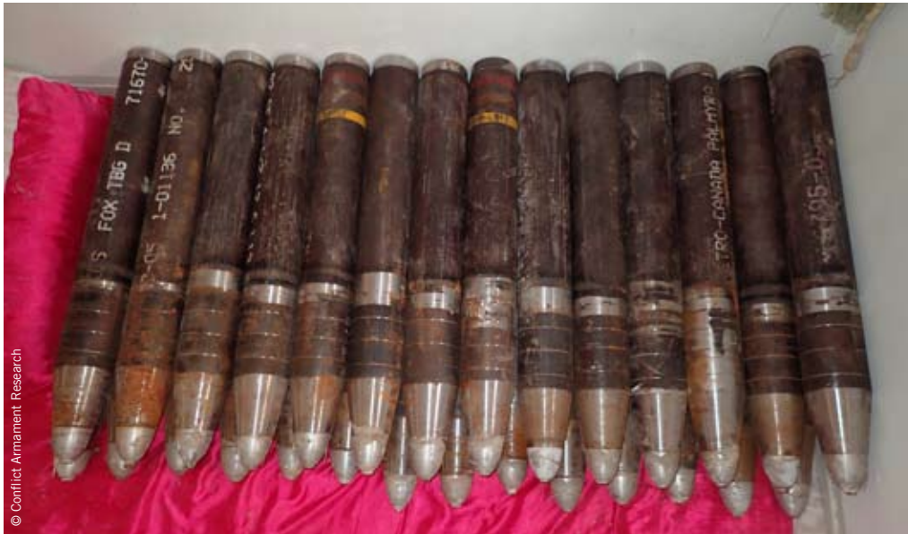
Improvised ground-to-ground rockets manufactured by IS forces and captured by Syrian Kurdish People's Protection Units in Kobane, documented by a Conflict Armament Research Field Investigation team on 21 February 2015 in Kobane.