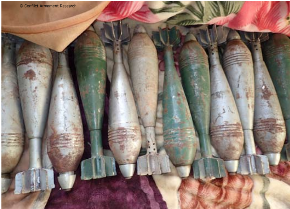
Improvised mortar rounds manufactured by IS forces and captured by Syrian Kurdish People's Protection Units documented by a Conflict Armament Research Field Investigation team on 21 February 2015 in Kobane.

IS captured an unknown quantity of 155mm M198 towed howitzers from Iraqi military stocks during its capture of Mosul in June 2014, along with the older Chinese Type 59-1, which the Iraqi army used extensively during the 1980-1988 Iran-Iraq war. 23 IS has also captured former Soviet Union D-30 and M-30 122mm howitzers from Syrian military stocks and small numbers of the older, and now obsolete, M-30 models which were probably taken from the Syrian army's reserve storage for deployment.