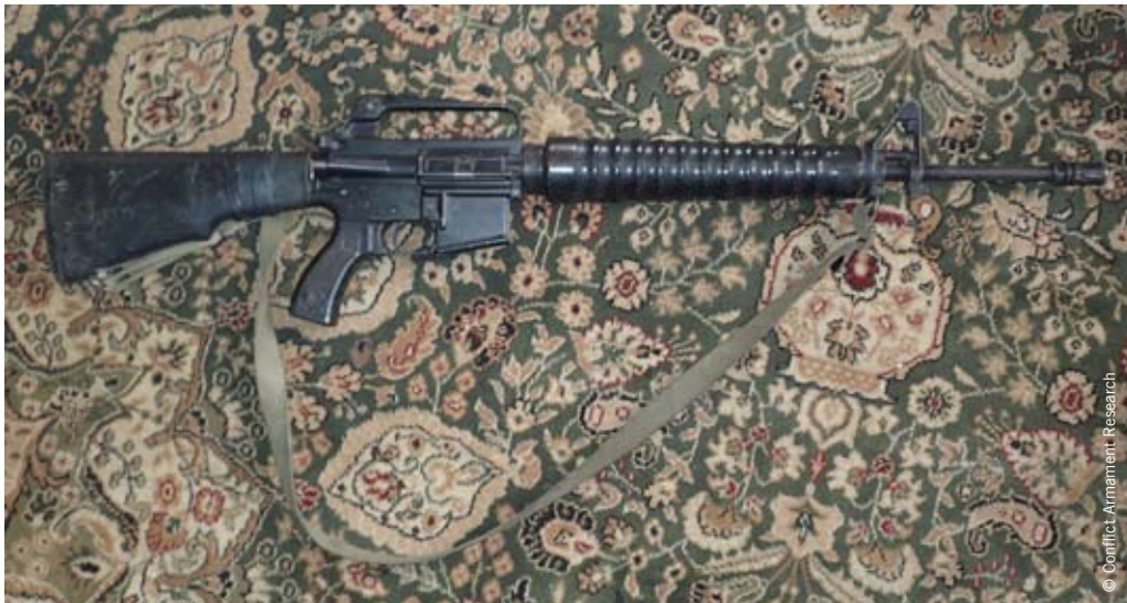
Chinese CQ 5.56mm rifle captured from IS forces by Syrian Kurdish People’s Protection Units during the siege of Kobane and documented by a Conflict Armament Research field investigation team on 24 February 2015 in Kobane.

In February 2015, Conflict Armament Research documented two Chinese CQ 5.56mm rifles which had been captured from IS fighters by Kurdish People’s Protection Units fighters. The rifles had had their serial numbers ground off and painted over with black paint; they were loaded with Chinese ammunition manufactured in 2008. Exactly the same configuration – from the removed serial numbers to the black paint and 2008 Chinese ammunition – had previously been observed by Conflict Armament Research and Small Arms Survey researchers in relation to Chinese CQ rifles identified in South Sudan among rebel forces in 2013. 66