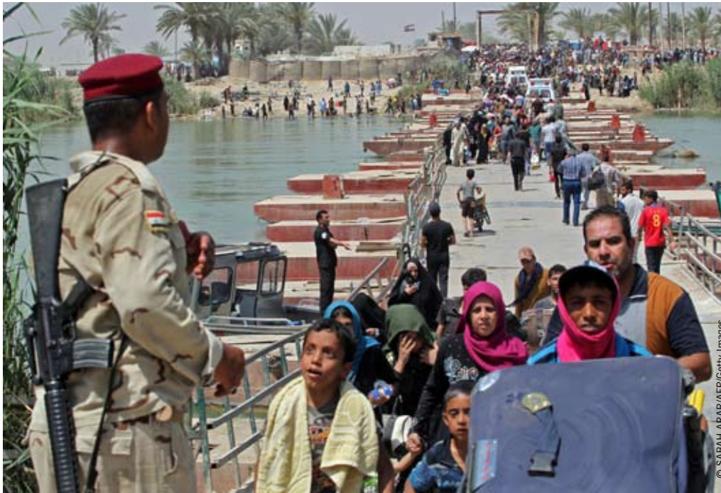
Residents from Ramadi, displaced by IS' capture of the city, wait to cross Bzeibez bridge on the southwestern frontier of Baghdad, May 2015.

entered Iraq with private security companies during the US occupation and found their way into Iraqi arms markets. 49