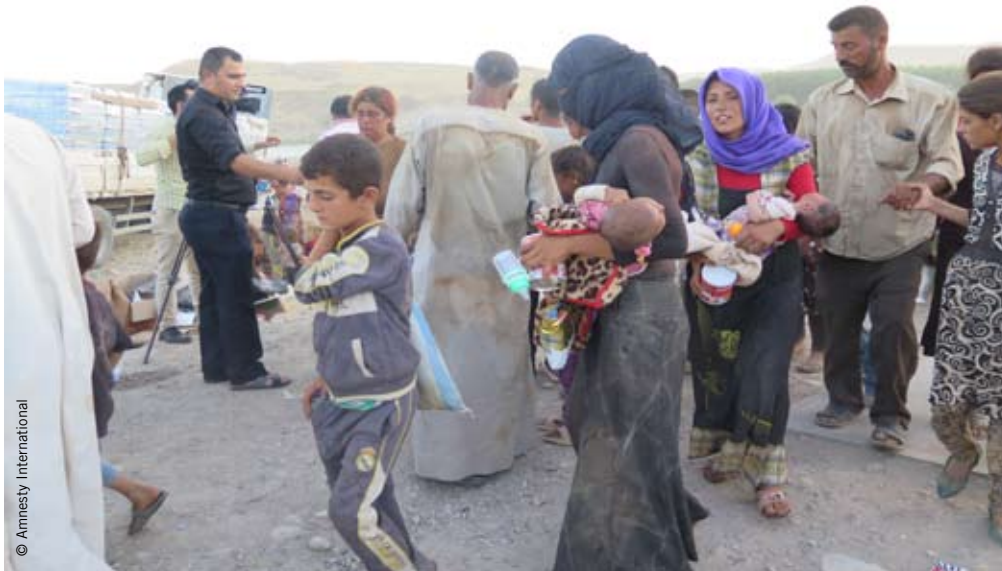
Yezidi internally displaced people arrive in Feshkhabour, Iraq, having fled Mount Sinjar after a week under siege from IS, August 2014

While much of the violence pitted Shi'a militias against Sunni armed groups, in 2008 Amnesty International reported further gross human rights abuses including the targeting of religious and ethnic minorities and others including "Yazidis, Christians, Sabeans and Palestinians... women, human rights defenders, judges, medical doctors and other professionals". 136 More recently, in 2014, Amnesty International documented Shi'a militia groups' systematic abductions and killings of Sunni civilians in Iraq, amounting to war crimes. The Shi'a militia groups were often armed and supported by the Iraqi military, and operating with their tacit support. 137