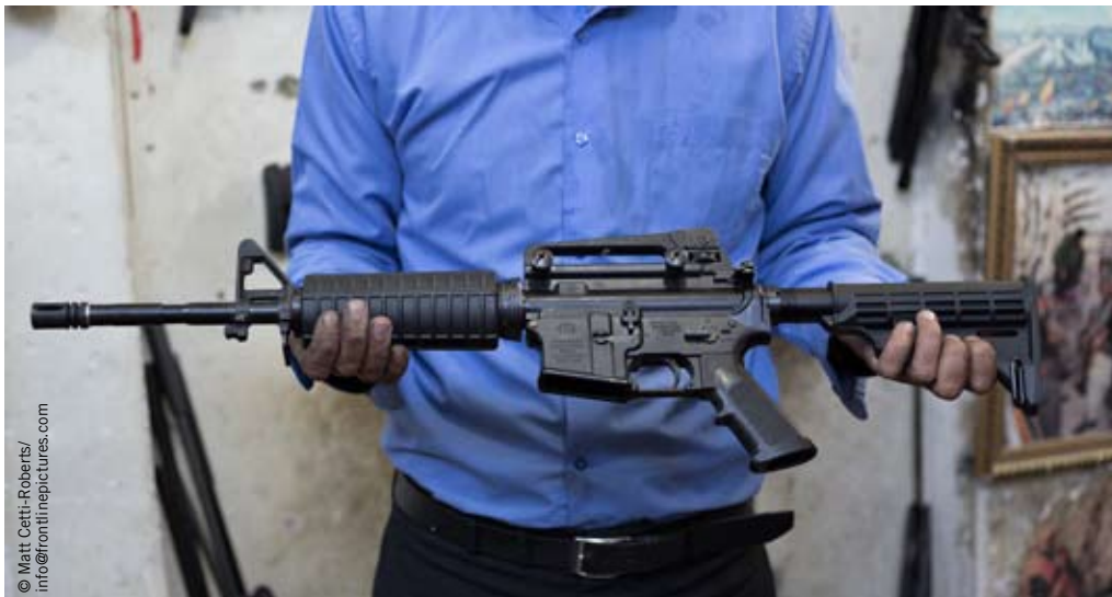
A Kurdish gunsmith holds a US-made M16A4, previously in the possession of the Iraqi army, and later IS, after the weapon was converted in to an M4 carbine-type rifle. Erbil, September 2014.

The main rifle type used by IS is the AK (Avtomat Kalashnikov) family of automatic rifles, as well as close copies and derivatives, with a bias towards the Russian and Chinese types that have been the staple of the Iraqi army for decades. Most of these weapons are decades old, though the more modern Russian AK-74M is in evidence, most probably looted from Syrian army stocks. IS forces have also captured US-manufactured small arms, including M16 assault rifles, along with Chinese, Croatian, Belgian and Austrian small arms. 9