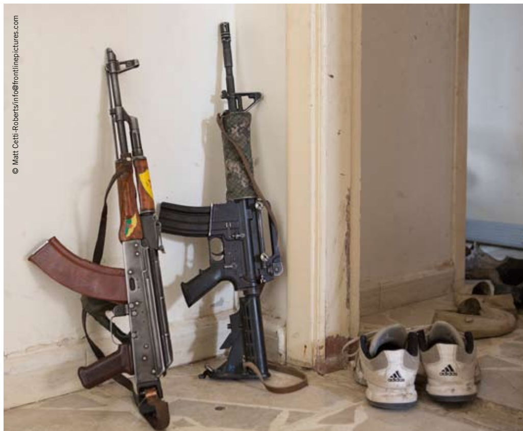
A Chinese-made Kalashnikov and an American M4 rifle (the latter captured from IS fighters) lean against a wall in a building occupied by Syrian Kurdish People's Protection Units fighters in Al-Yarubiyah, Syria, September 2014.