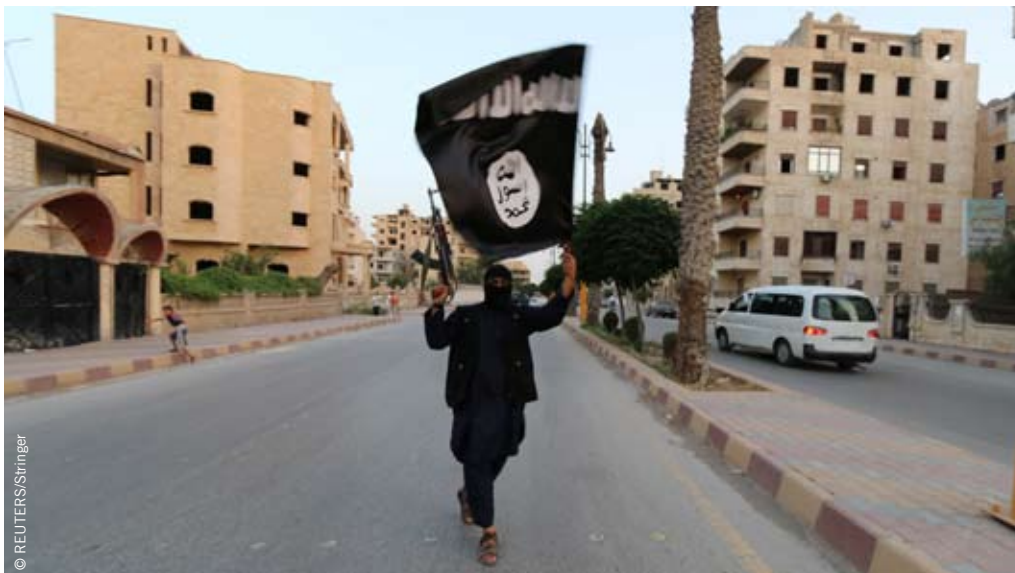
IS fighter waves the IS flag in al-Raqqa, Syria, June 2014.

After a brief summary of IS' formation and subsequent expansion, this chapter describes the arsenal of the armed group which has allowed it to maintain its control over parts of Iraq and Syria and commit crimes under international law.