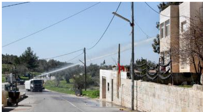
Israeli army spray residential area in Nabi Saleh with "skunk" water, March 2013.