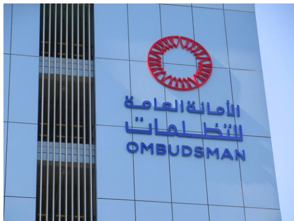
The Ombudsman Office of the Ministry of Interior

Since their establishment by the government in 2012 with a mandate to monitor and investigate human rights violations and ensure accountability, the new institutions – notably the Ombudsman of the Ministry of Interior and the Special Investigation Unit – have proved largely ineffective and continued to face distrust from the predominantly Shi'a critics and