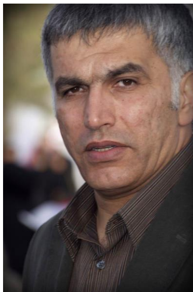
Nabeel Rajab

Prominent human right activist Nabeel Rajab 41 was arrested on 1 October 2014 after he was summoned to the Cyber Crime Unit of the CID following his return from a trip abroad during