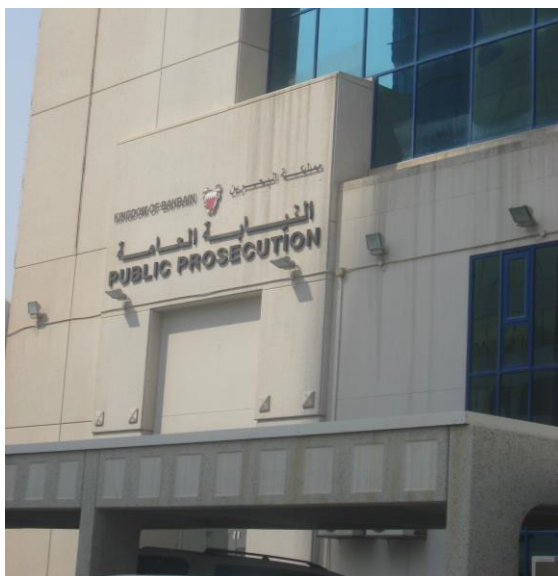
Public Prosecution Office where the Special Investigation Unit is located, Manama

Like other institutions, the SIU has obtained the assistance of international experts and agencies to provide human rights training for its officials. In June 2014, for example, the SIU signed a memorandum of understanding with the United Nations Development Programme (UNDP) to train all SIU officials in investigating deaths in custody or death resulting from the actions of the security forces and allegations of torture and other ill-