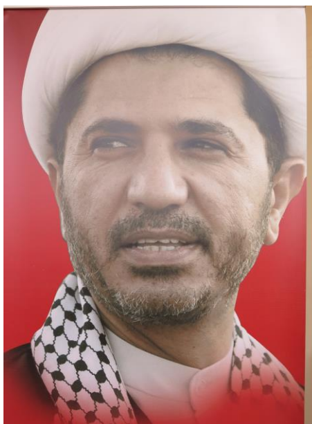
Photo of a poster of Sheikh 'Ali Salman outside al-Wefaq's headquarters, Manama