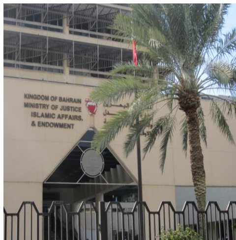
Ministry of Justice building, Manama

The Minister of Justice was also empowered through further amendments to the Law on Political Associations in August 2014 (Law 34 of 2014) to file court cases to close political associations for up to three months in order for them to correct breaches of the law on political associations, the constitution or any other laws or, in the case of a "serious breach" to close the association. However, the decree fails to define what constitutes a "serious breach" leaving a level of ambiguity injurious to the free functioning of political associations. Law 34 of 2014 also prohibits political associations from "using a religious platform to spread their principles, objectives and programmes or use religion as a reference" (Article 10 as amended) and from "directing [their] activities and programmes for sectarian goals or to damage national economy or the public interests of the state" (Article 6 as amended).