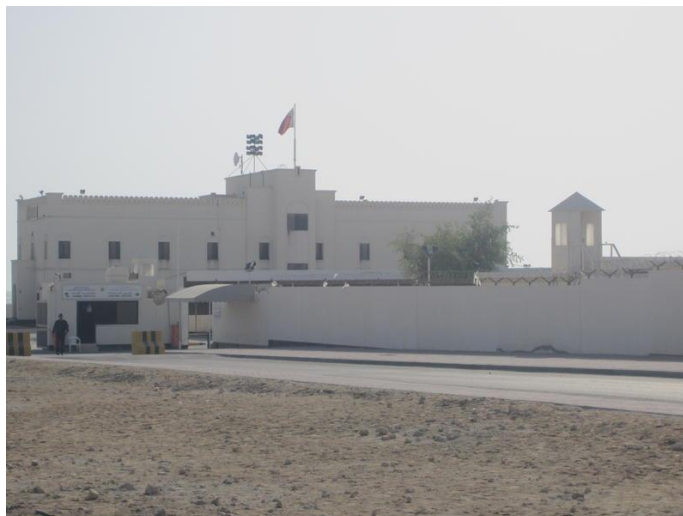
Jaw Prison, Manama