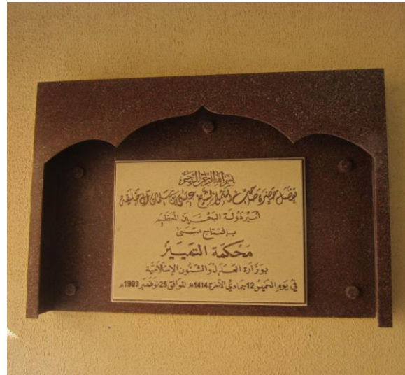
Court of Cassation, Manama

In January 2015, the SIU provided Amnesty International with statistics on its investigations since its establishment on 27 February 2012. According to this data, the SIU had referred 36 cases to trial, including nine involving cases of death due to force or torture in which 21 members of the security forces faced charges. The other 27 cases involved torture and other ill-treatment, and led to 48 members of the security forces facing charges. The SIU information indicated that 15 of the officers charged held the rank of First and Second Lieutenant and Lieutenant-Colonel, while the rest held lower rank. The SIU told Amnesty International that it had appealed a total of 12 cases to the High Criminal Court of Appeal and two cases to the Court of Cassation. According to information available to Amnesty International, all cases appealed by the SIU were rejected by the courts, which upheld the initial sentence. Out of the 36