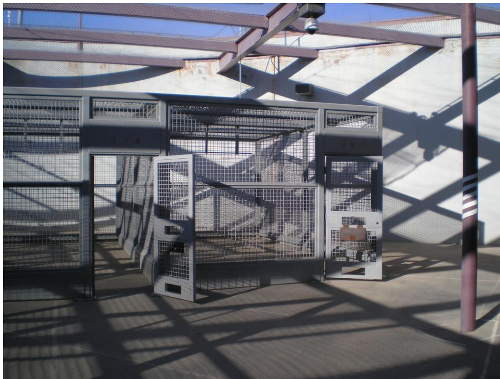
An outdoor recreation cage for prisoners in the Step Down Program at ADX

GP prisoners are allowed up to ten hours out-of-cell exercise a week, in two hour slots five days a week, alternating between indoor and outdoor exercise. Prisoners always take indoor exercise alone, in a windowless room with only a pull-up bar. Outdoor exercise takes place either in an enclosed solitary yard attached to the unit or in one of five individual cages in a larger yard. The only time a prisoner can communicate directly with another inmate is when conversing with a prisoner in an adjacent cage, an opportunity which takes place, at most, on two or three days a week.