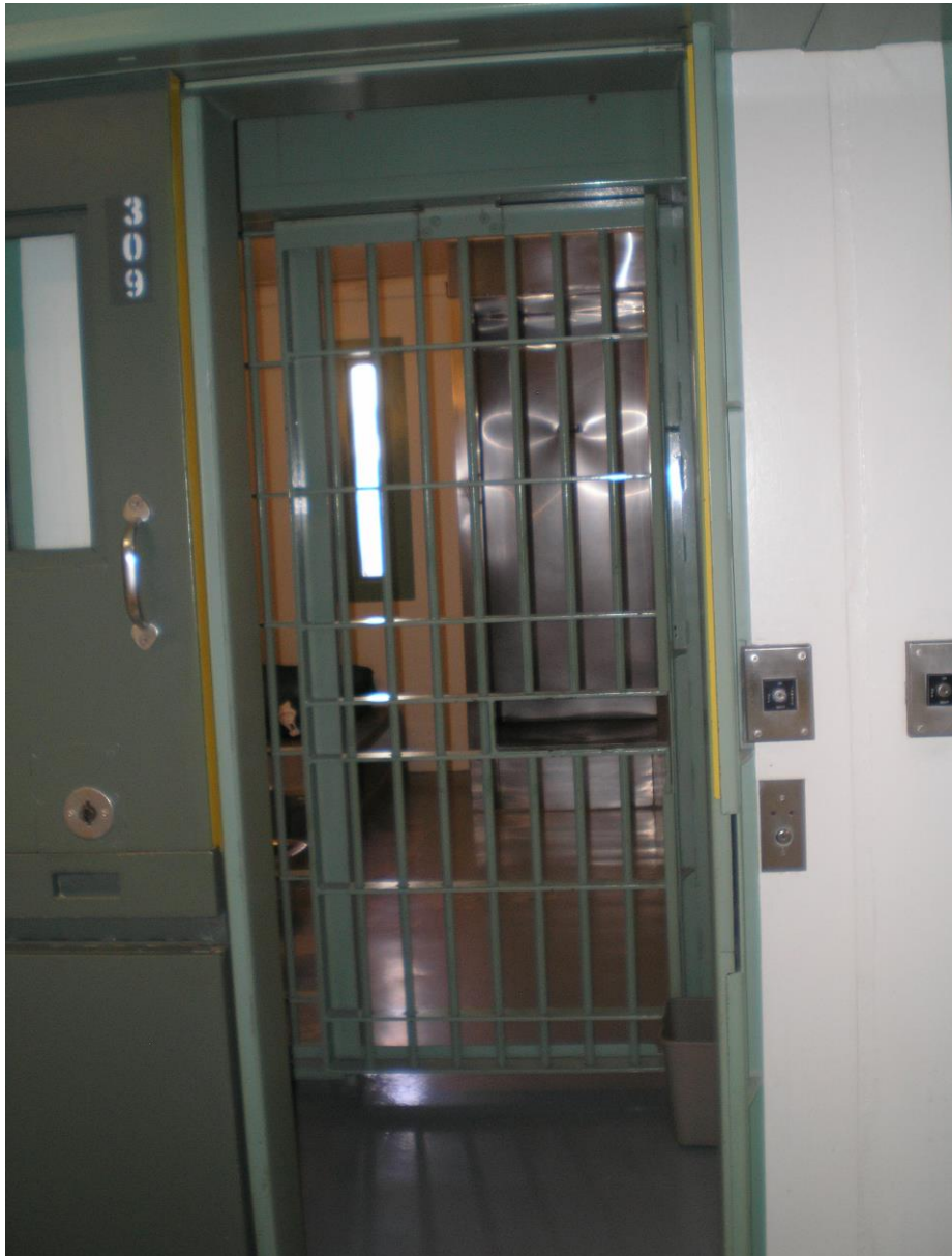
Inner door of a General Population cell at ADX , picture taken from the corridor

While Amnesty International's delegate recognized that there were a number of in-cell programs available at the time of her 2001 visit, these cannot compensate for the prolonged cellular confinement and social isolation experienced by ADX prisoners for many months or years, or even indefinitely. The value of in-cell programs becomes more questionable the longer a prisoner is held in isolation and unable to interact meaningfully with others. Prisoner advocates have also reported that, apart from some basic educational courses such as GED (which are required by a minority of inmates), there is not much structured educational or rehabilitative programing leading to formal qualifications or defined outcomes or goals. 35