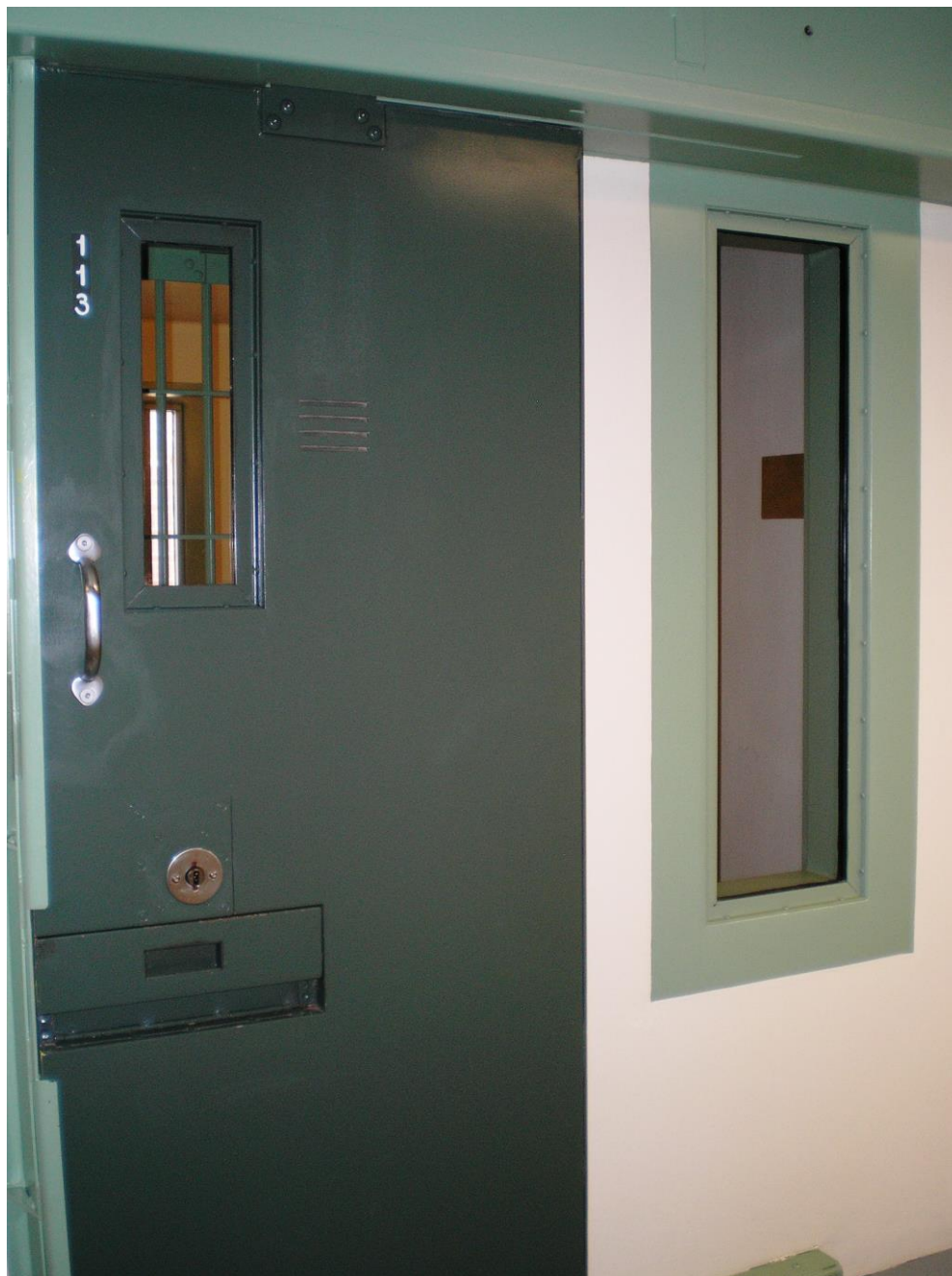
Outer door of a cell in the Control Unit at ADX, picture take from the corridor

A stipulated court agreement in 2008 provided that an Imam visit ADX four times a month to speak with inmates individually. Prison attorneys have reported that since there is no longer an Imam on site, inmates in the past few years have received far fewer visits from an Imam than the limit set in the court agreement. 33