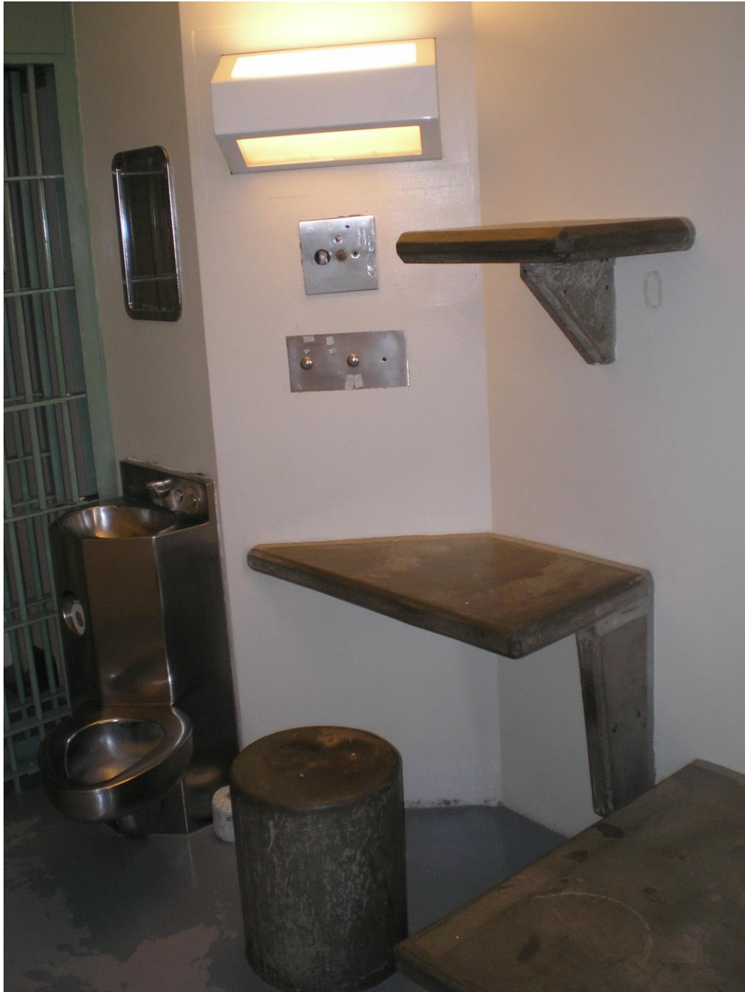
The inside of a cell in a General Population Unit at ADX

The vast majority of prisoners are allowed out of their cells for only a few hours a week, for exercise, occasional visits to a “law library” cell, social or legal visits, or for some medical consultations. 26 All meals are delivered to and eaten inside the cells. As Amnesty International has observed elsewhere, there is concern about the possible health risks from spending so much time in a confined space, and eating all meals in close proximity to the open toilet. Prisoners are placed in full restraints and are accompanied by two guards when being escorted out of their cells. Otherwise nearly all contact with staff takes place either remotely (e.g. through medical teleconferencing) or at the cell front.