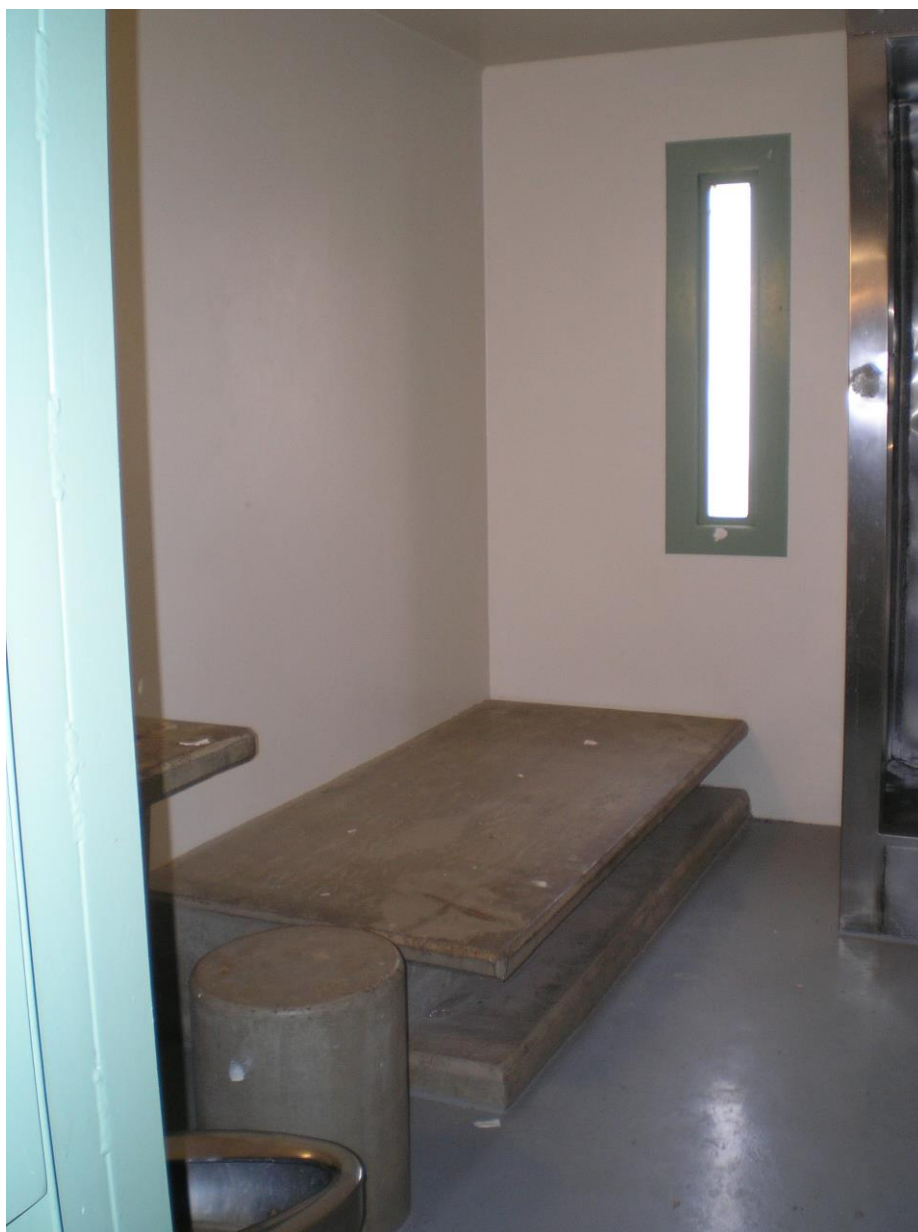
Interior of a SHU cell at ADX

Prisoners in the CU have no access to the SDP but they can receive monthly credits for positive behaviour which can reduce their terms; they may also lose credit for disciplinary offences or failure to adjust. ADX regulations require that all prisoners receive monthly reviews by a CU Team attended by a psychologist. An Executive Panel reviews each CU case every 60-90 days to determine an inmate's readiness for release (to another prison or to the ADX GP). 69