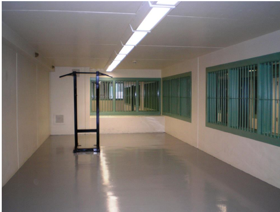
Indoor recreation area in the Control Unit at ADX

The opportunity to exercise is particularly important for the physical and psychological wellbeing of prisoners who are cut off from normal activities and are confined to cells for prolonged periods. Neither the cages nor the enclosed individual yards in Amnesty International’s view meet the standard of “suitable exercise in the open air” as provided under the SMR, nor, under the present regime at ADX, is outdoor exercise provided to each prisoner daily.