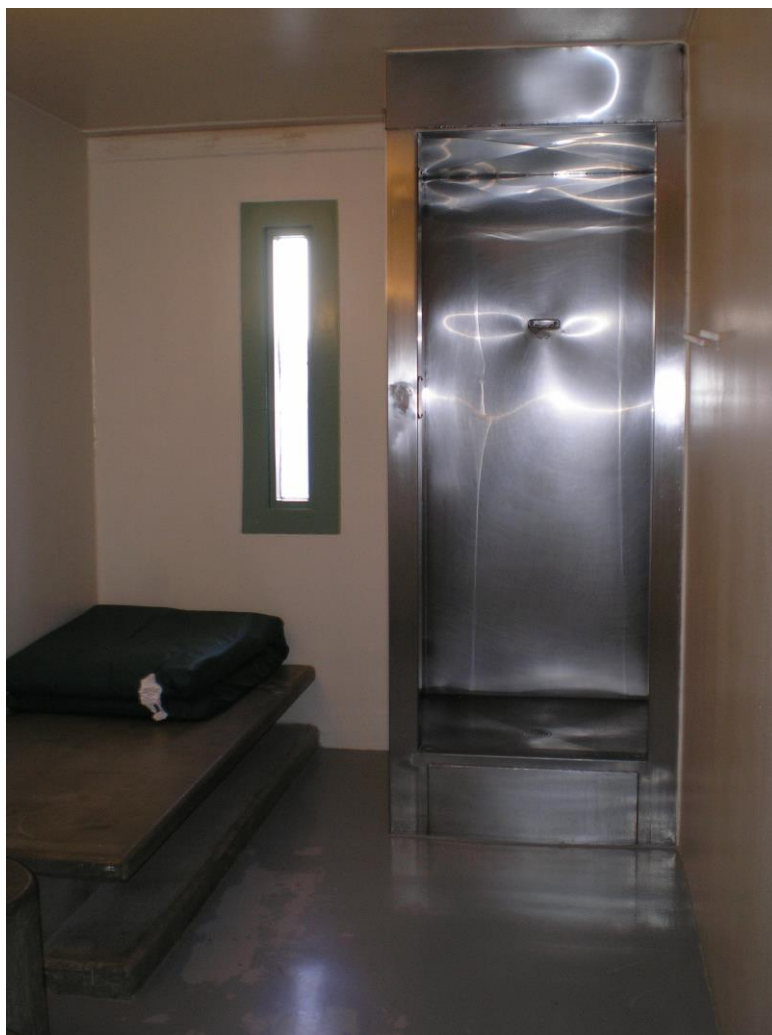
An isolation cell in a General Population Unit at United States Penitentiary, Administrative Maximum (ADX)