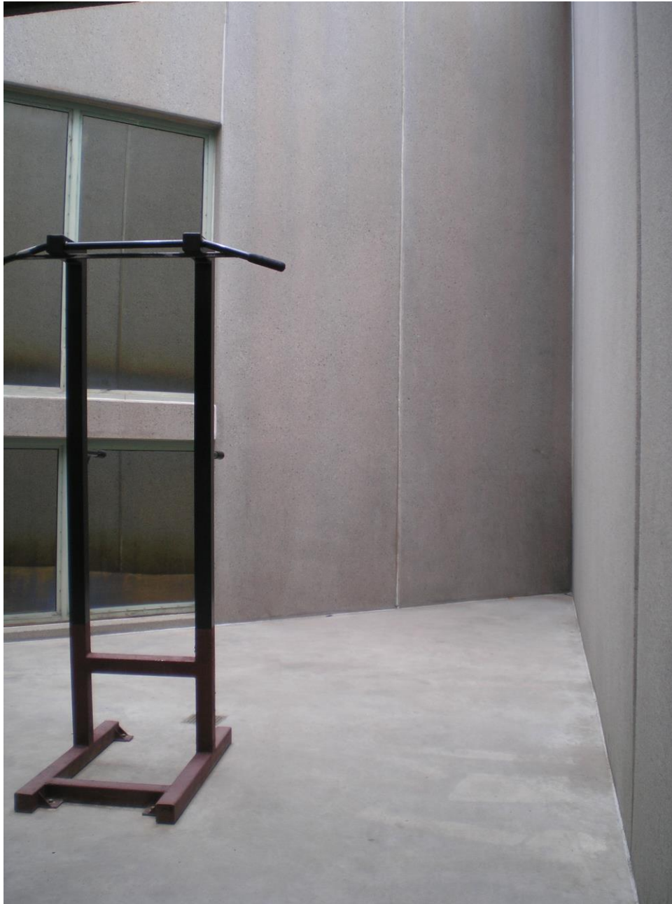
An outdoor recreation area in the Control Unit at ADX

According to BOP regulations, prisoners may have their exercise in the larger yards suspended for three months at a time for a single rule violation, with increased suspensions for further offences. 27 It is alleged that prisoners are sometimes punished for minor rule violations, such as in one case for feeding crumbs to birds. 28 The regulations list violations for which the yard exercise can be suspended as including “sexual acts or gestures, suicidal attempts or gestures, smearing or throwing human waste”. 29 Amnesty International is concerned that prisoners who have not committed serious violations, or whose behaviour may be indicative of mental health or behavioural problems, should have their outdoor yard exercise -- and thus their only limited association with other inmates -- withdrawn for such extended periods. It urges that this rule be reviewed.