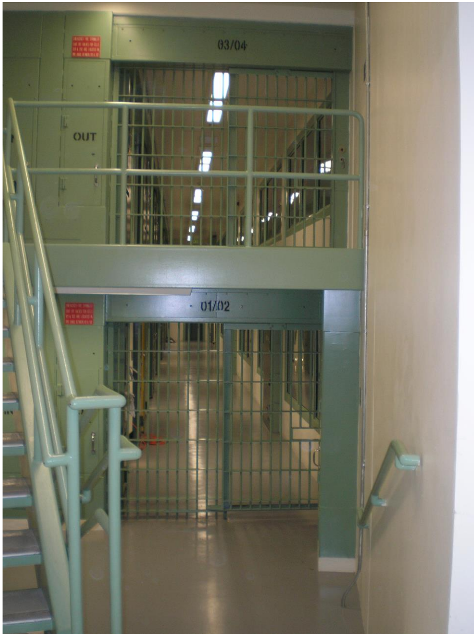
The SHU range in ADX

The Control Unit (CU), together with the SHU and Range 13, are the most isolated units in ADX as prisoners recreate alone and have no contact with anyone other than staff. Prisoners are assigned to the CU for fixed terms for serious offences, usually committed in other prisons, after a hearing which is similar to a disciplinary hearing. The fixed terms can be as long as six years or more, 68 and may be extended if further offences are committed while the prisoner is in the Unit.