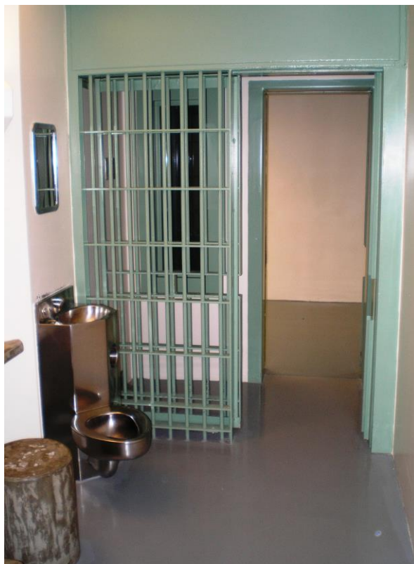
Inside of a cell in the Control unit at ADX

The TU and the Pre-Transfer Unit were both originally sited at the ADX facility but are now located at USP Florence, a high security prison which, like ADX, forms part of the Federal Correctional Complex (FCC) at Florence. ADX itself has therefore become almost entirely a "lock-down" facility in which prisoners are locked in solitary cells for all but a few hours a week. Amnesty International is concerned that, at a time when there is growing recognition of the damaging effects of isolation and moves to restrict such practice in some states, conditions in ADX have become more restrictive in recent years.