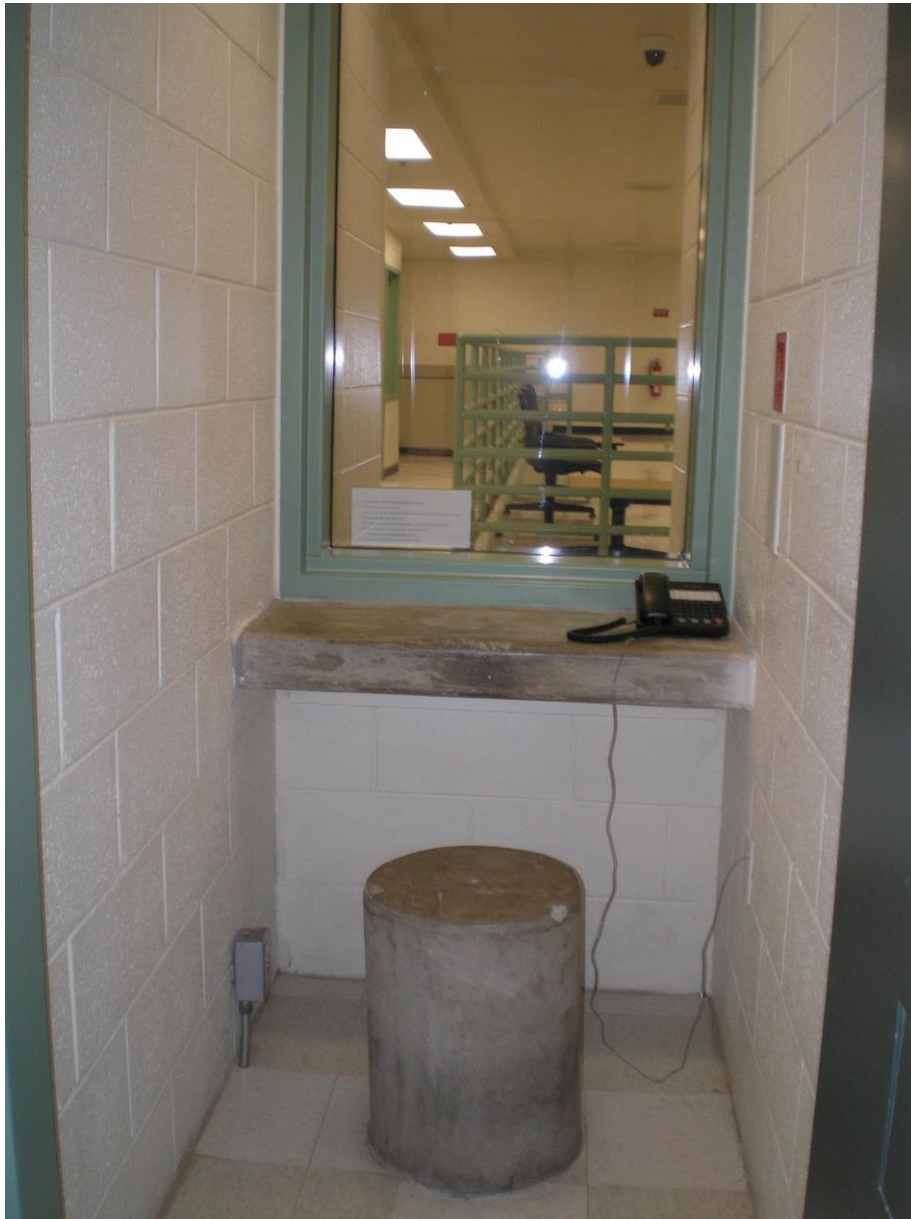
The inmate side of the social visits compartment

Amnesty International believes the degree of restraint applied routinely during non-contact visits appear to be unnecessarily punitive, especially for prisoners who do not have a history of serious rule violations or acts of institutional violence within the facility, and for prisoners needing to communicate with attorneys. International standards provide that restraints should be applied only when “strictly necessary” as a precaution against escape or to prevent damage or injury. 40