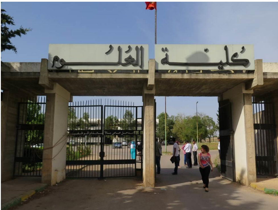
Photo: Science Faculty, Dhar El Mehraz campus, Sidi Mohamed Ben Abdellah University in Fes