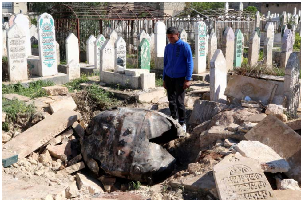
A man looks down at an unexploded barrel bomb dropped by forces loyal to Syria's President Bashar al-Assad at a cemetery in the al-Qatanah neighbourhood of Aleppo. 27 March 2014

According to the Syrian Network for Human Rights, 12,194 people were killed in Syria from 2012 until February 2015 as a result of barrel bomb attacks by government forces. Only 473 of these people were fighters, meaning that 96% of this total were civilians. More than half were killed after the adoption of UN Security Council Resolution 2139. As of February 2015, of all governorates in Syria, Aleppo suffered the greatest number of victims from barrel bomb attacks. According to the Violations Documentation Center, 3,124 civilians – and only 35 fighters – were killed in barrel bomb attacks from January 2014 to March 2015 in Aleppo governorate. Local monitors told Amnesty International that the large number of civilian casualties is likely due to the fact that barrel bombs are so imprecise that the government rarely drops them near the front line, where they might hit their own forces. Instead, barrel bombs have struck apartment buildings and populated areas such as public markets, transportation hubs and mosques.