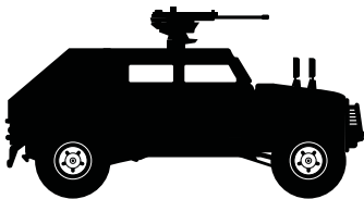
Sherpa Light Scout