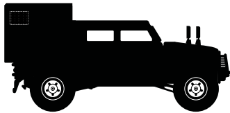
Sherpa Light Station Wagon