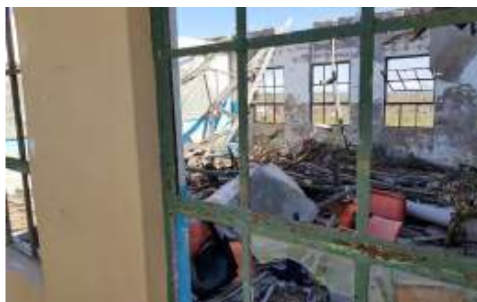
👁️ ← Imiqhayi school, Mount Coke, King Williams Town, Eastern Cape.

A more equitable share formula would take both of these factors into account. It would also increase the weighting given to the poverty component so that provinces with a higher share of their population living in poverty would receive more funds. 438