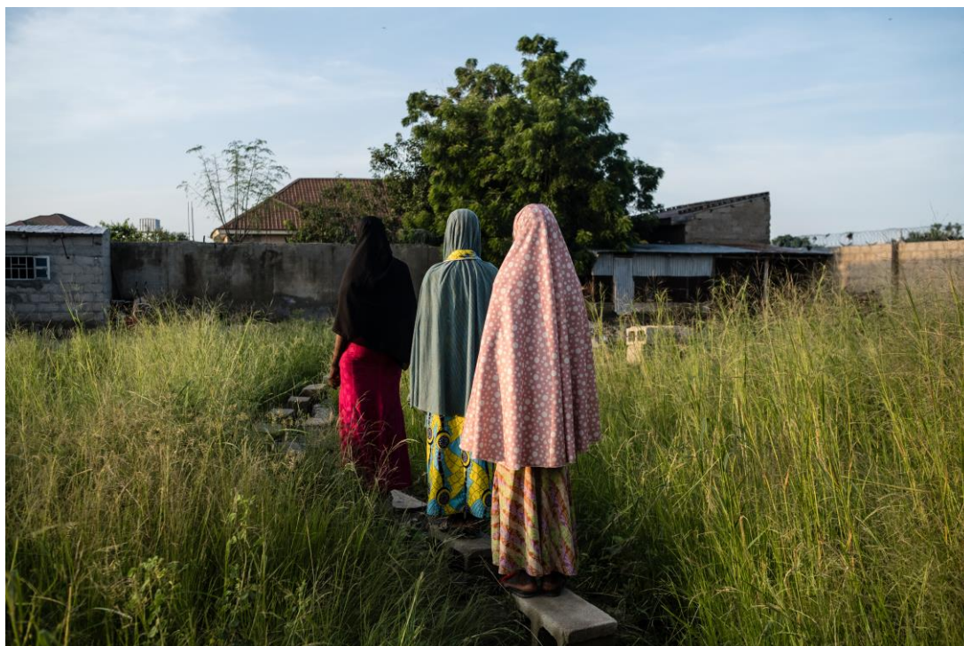
Three women and girls walk home in Maiduguri, Nigeria, on 4 September 2019. One woman had been abducted by Boko Haram as a girl and then detained in Giwa Barracks for 15 months after escaping. Another spent two years in Giwa.