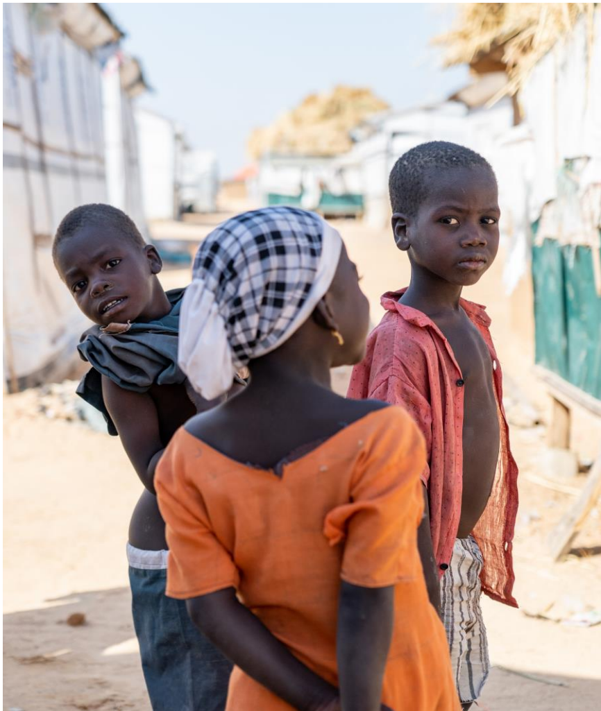
Displaced children unable to access education in Dalori 1 Camp outside Maiduguri, Borno State.

To date, the Nigerian government has fallen well short of that obligation. Instead, as subsequent chapters detail, the military has detained thousands of boys and girls coming out of Boko Haram territory for months and even years; subjected the vast majority of those in detention to torture or other ill-treatment; reached few children with psychosocial support; impeded humanitarian assistance and otherwise failed to respect many displaced children’s rights to food and to physical and mental health, exacerbating underlying distress; and failed to ensure children have access to education.