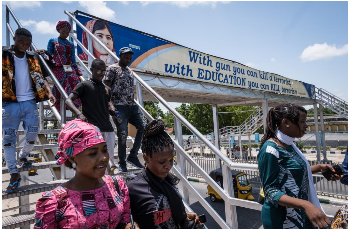
People in Maiduguri cross a pedestrian bridge with a large banner proclaiming the importance of education in the context of the conflict, Borno State, Nigeria, 2019.

Although military use of schools is beyond this report’s scope, in March 2019 Nigeria took the important step of formally committing to the Safe Schools Declaration, a political agreement endorsed by 103 states, as of 30 April 2020, with “a set of commitments to strengthen the protection of education from attack and restrict use of schools and universities for military purposes.” 440 In light of that action, the federal government has begun the process of revising the Armed Forces Act to protect schools from military occupation and use.