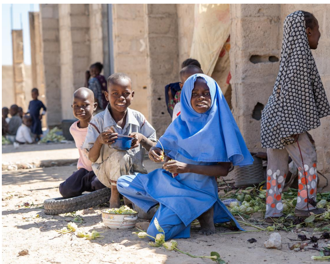
After finishing class in primary school, a girl (in blue uniform) plays with other children who are not in school, before going home, Kaleri, Borno State, Nigeria, 2019. The area, located near Jere, has been attacked several times by Boko Haram.