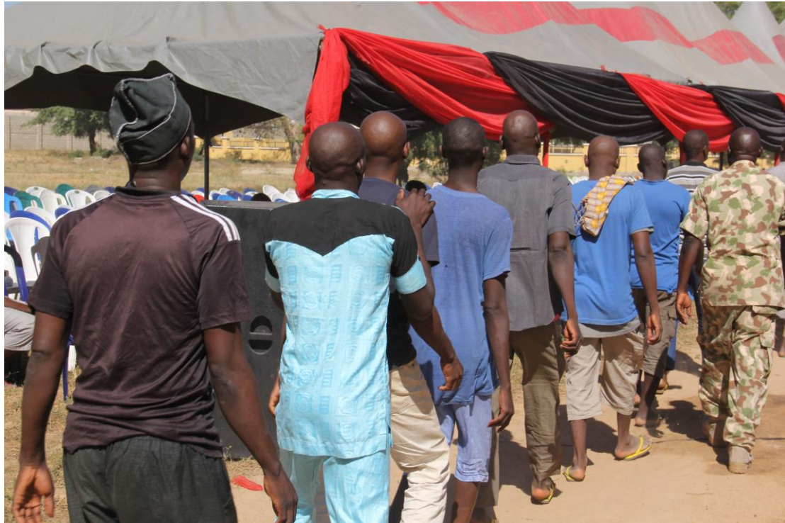
Men and boys released from Giwa Barracks after months or years of unlawful detention walk in a line as they are handed over to state officials in charge of a “transit centre” where they will be held before returning to their communities, 27 November 2019, Maiduguri, Borno State.