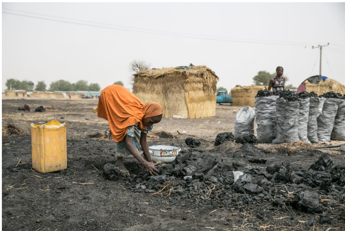
A girl picks up charcoals inside an IDP camp on 21 April 2019 in Maiduguri, Nigeria.