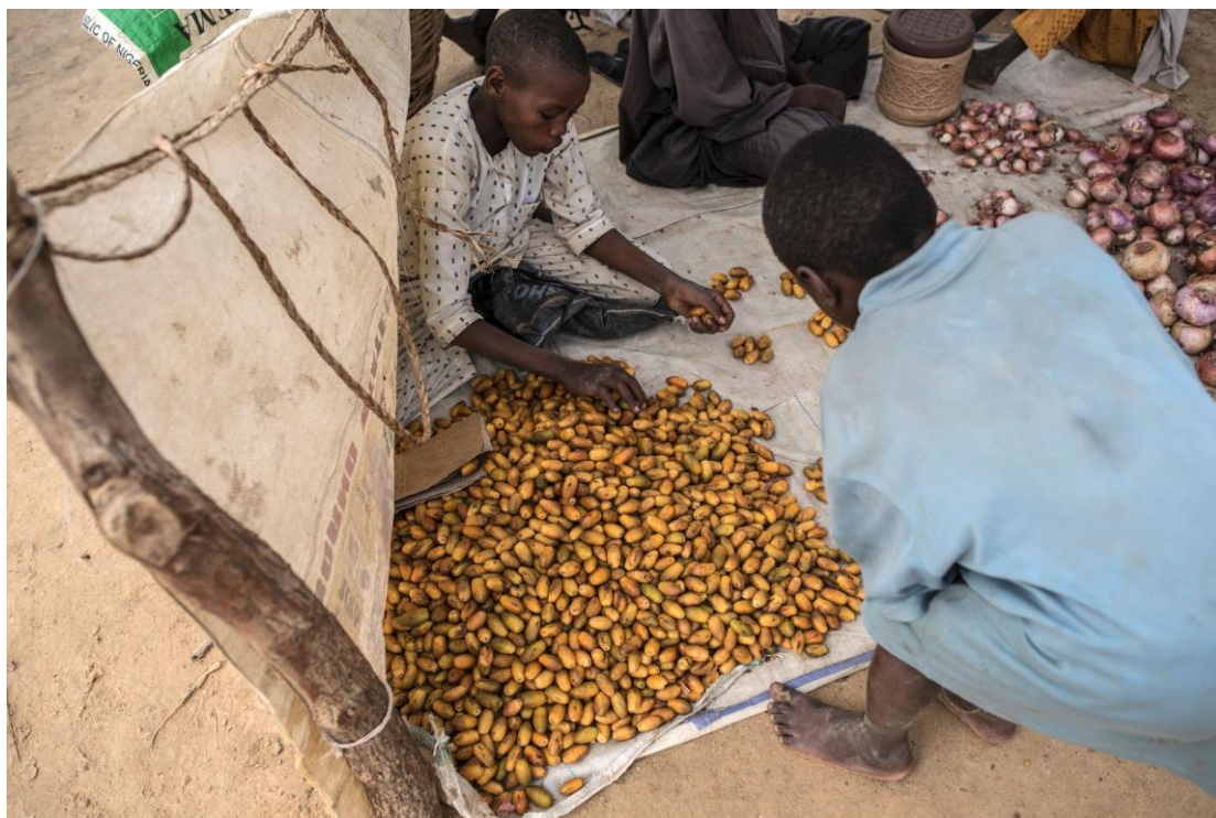
Boys sort through fruit at a vendor in the Bakasi IDP Camp on 6 July 2017, Maiduguri, Borno State.