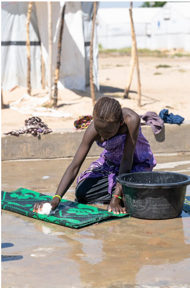
A girl washes a sleeping mat in Bakasi IDP Camp, Maiduguri, Borno State, 2019.

The school is far... From Water Board to the front of the market [near the school] is 50 naira each. For the two of them it's 100, to come back is also 100, so I give them 200 naira (US$0.51) daily for transport... What I do for work is go to the bush and get firewood; I sell it, leaving some for cooking, and out of the money [made], I pay their daily fare. Sometimes I won't even have money to pay for their transport. Those days they come back on foot. If [the school] close[s] at 1pm on days they don't have money, they get home around 3pm. If you're an adult and you're walking very fast, you may get to the camp in 45 minutes, but you know children will want to play on the road. 472