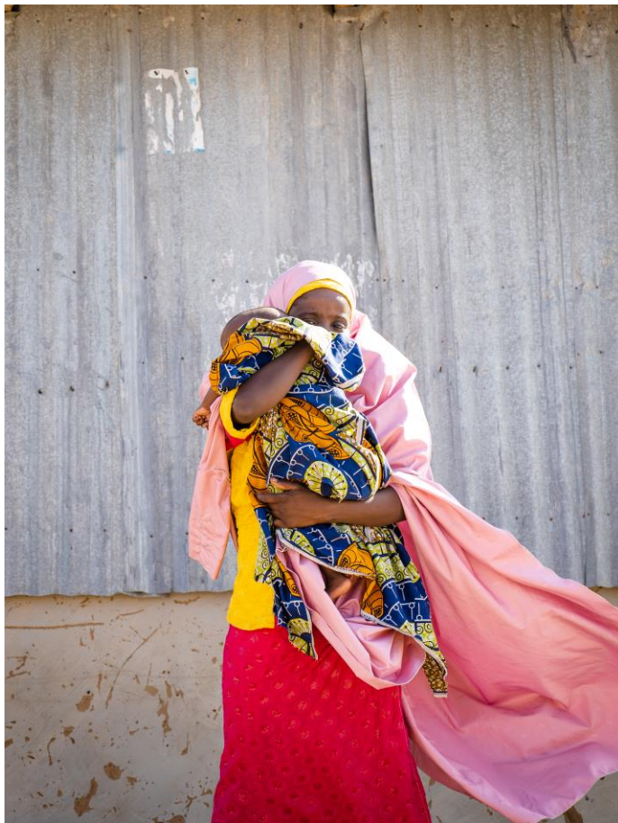
A 17-year-old girl abducted by Boko Haram and held captive for two years holds her young child, after having escaped. She is displaced to an IDP camp in Borno State, Nigeria, 2019.

Punishments also seem particularly severe or frequent for abducted Christian girls. An 18-year-old woman who was abducted at age 12 or 13 and held for four years recalled: “They forced us to learn the Qur’an and would lash whoever was not paying attention or not able to recite their verses... As a Christian, it meant they lashed me every day, because I could not learn. They’d lash me... and call me an infidel.” 86 The woman had a son from her forced marriage and said her “husband” was killed two years into her captivity. “They said after my first menstruation [after the son’s birth], I’d have to remarry,” she recalled. “They kept coming to ask if I’d started menstruation and I said no.” 87 She later escaped with another woman.