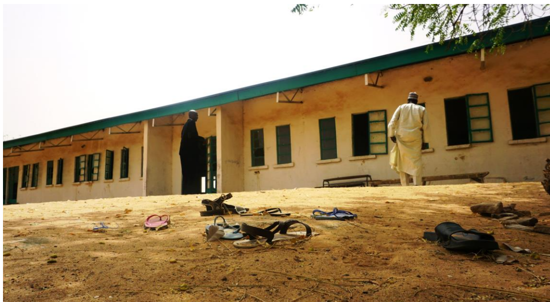
Sandals are strewn in the yard of the Government Girls Science and Technical College staff quarters in Dapchi, Nigeria, on 22 February 2018, after more than 100 girls were abducted by Boko Haram several days earlier.

The abductions have a cascade of negative effects on families, including the pain of not knowing whether the person is alive. “I never saw or heard about my mother or siblings and always wondered what happened to them,” said a 16-year-old girl who was abducted with them from a village in Michika LGA, Adamawa State, and then separated from them in Sambisa, which she escaped in late 2018. 64