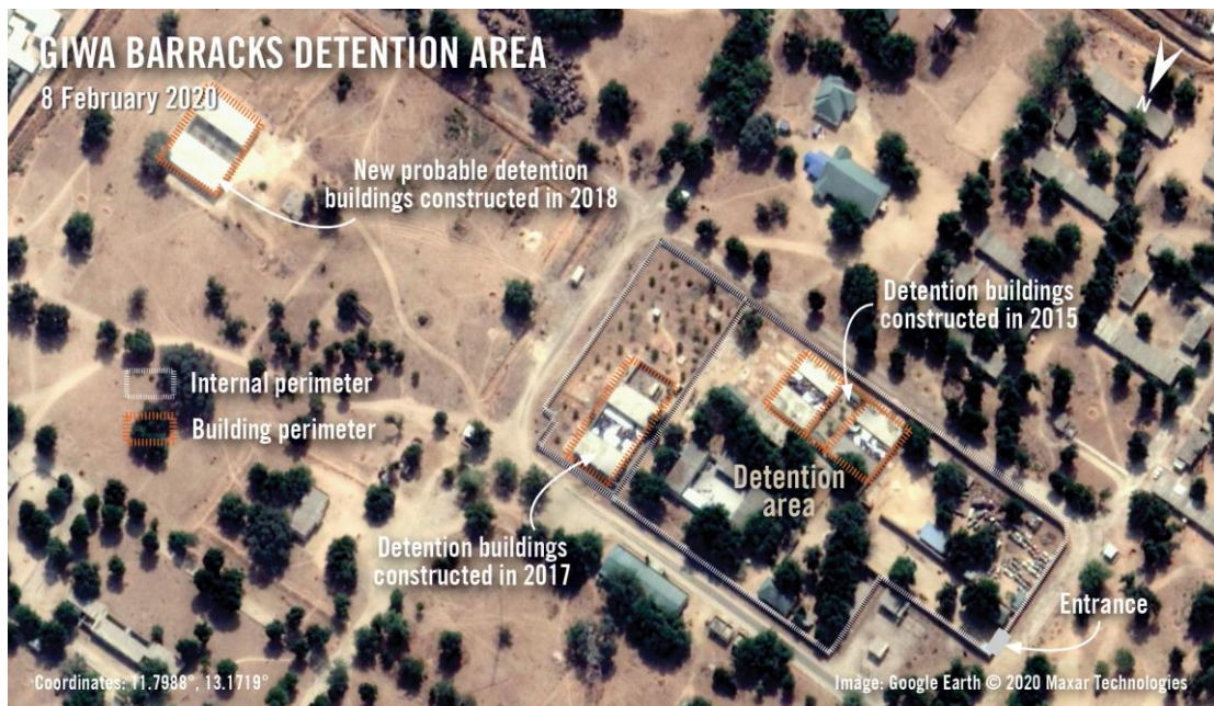
Giwa Barracks has an internal, secondary perimeter that encloses the detention area. In 2015, new detention buildings were constructed within the detention area. The two sets of buildings are separated by a common area that is also enclosed. In 2017, new similar but larger buildings were built in a separately enclosed area. In 2018, construction began on new buildings east of the main detention area. In 2020, they appear to be close to completion but not visibly occupied. The buildings are larger, but the layout is similar to the detention buildings constructed in 2015 and 2017.