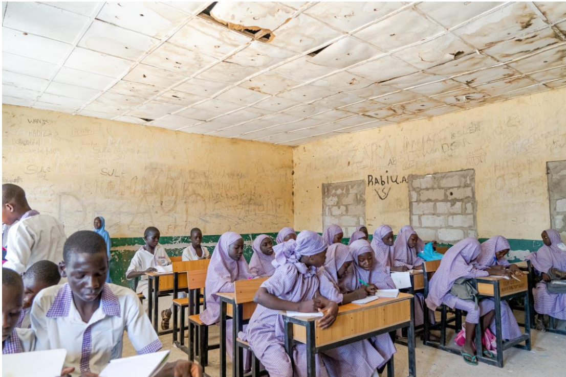
Children sit at their desks in Kaleri primary school, located in the host community, Borno State, 2019. The area has been attacked by Boko Haram several times.

Some parents and other guardians told Amnesty International they had pulled children out of school after hearing how they spent their time; some parents and community leaders had gone to see classes for themselves, before removing children. The father of a 10-year-old girl in Monguno's Water Board Camp said he registered his daughter for the school in town for displaced children and ensured she went every day, even providing money from the family's food distribution for the girl to take a keke tricycle taxi. However, the girl consistently returned and "told me they don't teach them anything in school, that they only go there to play. She told me they just go and sit on the bench every day, [often] no teacher comes into the class." 534 The father eventually decided to remove the girl from the school.