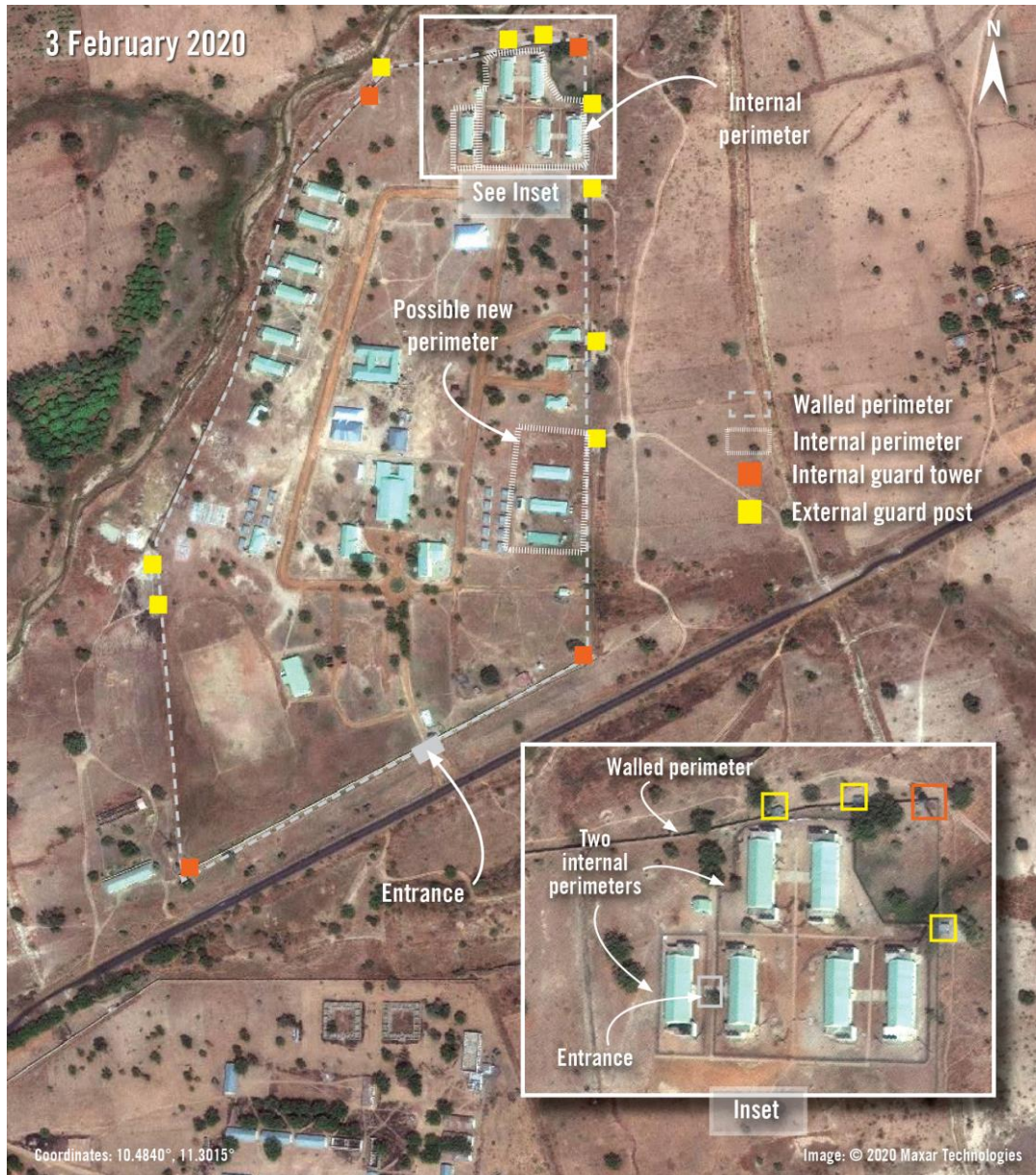
This area is located approximately 33 kilometers north of Gombe town. The entire facility is surrounded by a walled perimeter with one controlled entrance on the south side, next to the main road. There are nine structures along the walls outside the facility which could be guard posts, though the locations of the structures are somewhat erratic. There are also four probable guard towers inside the perimeter, at each corner. There are five buildings in the northeast corner that have a secondary perimeter. There is also a sixth building with a separate perimeter. The secondary perimeter and cluster of guard posts suggest it could be a detention area.

A person with direct knowledge said that with the current batch of more than 600 people, prison officials may now sometimes accompany detainees, rather than army intelligence. But the person said all movements still seem to be accompanied by a guard and that the environment is “highly regimented”. 321