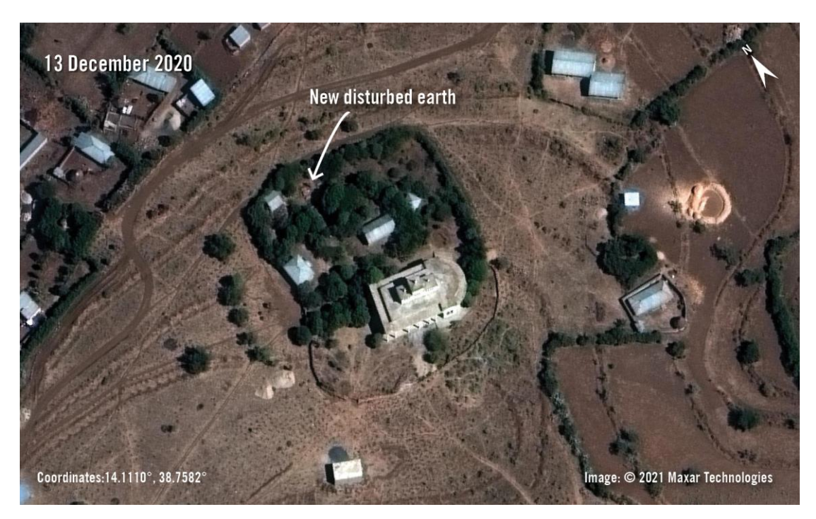
The Abune Aregawi church, located in the Semeret neighbourhood on the southeastern edge of Axum, shows new disturbed earth in satellite imagery from 13 December 2020. While in some churches the victims of the massacre were buried in vaults, witnesses say that in Abune Aregawi, the graves were dug in soil.