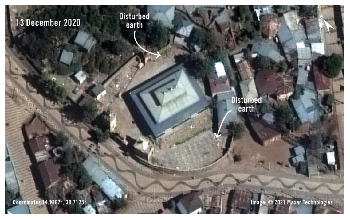
Satellite imagery taken on 13 December 2020 shows new disturbed earth at the Arba'etu Ensessa church in downtown Axum. It was here that, in the aftermath of the massacre, the largest funerals took place.

Two witnesses who spoke to the church authorities at Axum Tsion St Mary church (which encompasses Maryam Zion church proper as well as Arba'etu Ensessa) said 450 identified people were buried in that church alone. The figure excludes people who were buried there but not identified; the dead who were buried in other churches; and those who were buried on the roadside.