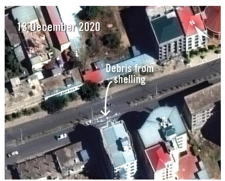
Debris from shelling is visible in front of the Brana Hotel, on Axum's old main road, in this satellite imagery from 13 December 2020. A man who had fled and who came back to the city around 25-26 November said: "After I came back to the city, I ... saw the Brana Hotel ... really damaged."