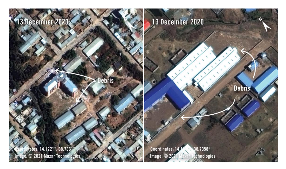
Debris consistent with looting around an unidentified building in central Axum, shown on satellite imagery from 13 December 2020. According to residents, Eritrean soldiers looted the university, private houses, hotels, hospitals, grain storage facilities, petrol stations, banks, electrical and maintenance stores, supermarkets, bakeries, jewelries, vendors' shacks (known locally as "containers"), and other shops, breaking through entrance doors with automatic weapons.