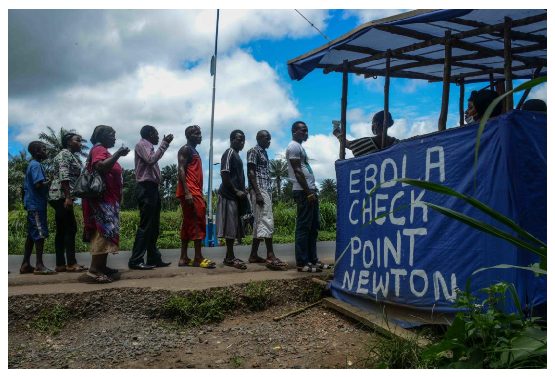
Travelers are stopped for screening, 25 May 2014, at one of many checkpoints that were set up on the 240km-long road from the capital Freetown to Kenema District in the east. The Ebola epidemic devastated communities and caused economic and social disruption amid repeated quarantines and pervasive fear.

In the context of Sierra Leone, several studies have been conducted on the mental health impact of the war and the Ebola outbreak, showing the high levels of distress they caused. Analyses of these studies point out that many of them have focused on subsets of the population or have tended to give particular attention to post-traumatic stress. <sup>12</sup> Also, most of the studies were conducted while the emergencies were ongoing, that is shortly after the war, or during the Ebola epidemic, for example; the main exception is a 15-year longitudinal study and associated research on the impact of the conflict on male and female children formerly associated with armed forces and armed groups (commonly referred to as former child soldiers). <sup>13</sup>