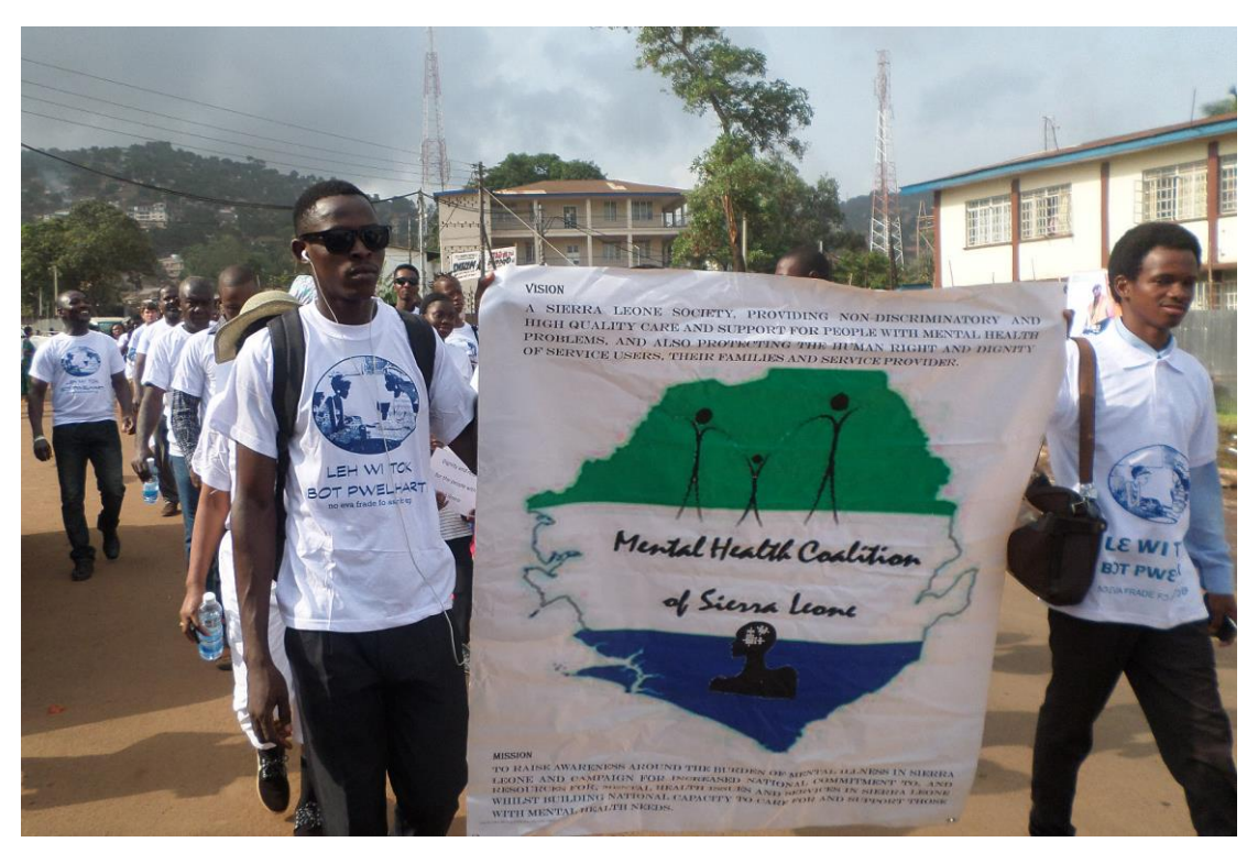
Members of the Mental Health Coalition march through Freetown on World Health Day, 7 April 2017, in a series of events held alongside the WHO and Ministry of Health to raise awareness about depression. The coalition has been at the forefront of activities aimed at fighting stigma surrounding mental health conditions.

said it is an area in which the country could use technical and financial assistance to help guide work aimed at fulfilling better access to care. Data aside, interviewees cited the interconnected barriers covered in this chapter—most of which are mirrored across the county's health sector—as major impediments to fulfilling even the most basic levels of needed care. Data aside, interviewees cited the interconnected barriers covered in this chapter—most of which are mirrored across the country's health sector—as major impediments to fulfilling even the most basic levels of needed care.