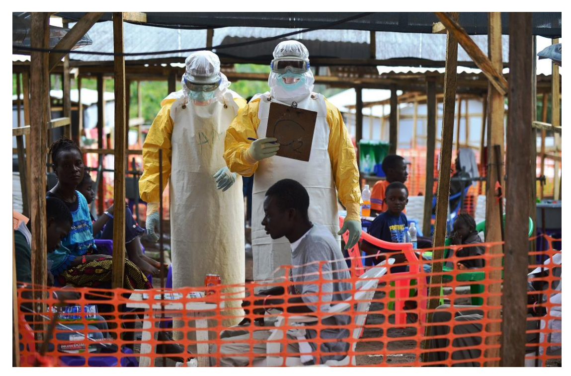
Health workers in protective gear are photographed alongside patients, 15 August 2014, at a Médecins Sans Frontières (MSF) facility in Kailahun, one of the districts hardest-hit by Ebola. Ebola survivors who told Amnesty International that they had received counselling during the crisis said it was provided by government mental health nurses and a variety of structured interventions from NGOs, including MSF.

Outside formal structures, several people interviewed said encouragement, support and acceptance from their families in the aftermath of their traumatic experiences were key in helping with their mental health and psychosocial wellbeing. For example, a man who lost a leg and sight in one eye due to a landmine explosion during the war said his wife's support brought him back from the brink after he had gone into isolation and considered ending his life. <sup>108</sup> This is reinforced by one of the core findings of a landmark 15-year longitudinal study on the mental health of male and female children formerly associated with armed forces and armed groups in Sierra Leone: that families' and communities' acceptance—or lack thereof—has been central in influencing their long-term mental health trajectories. <sup>109</sup>