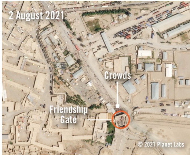
Spin Boldak border crossing. 2 August 2021.