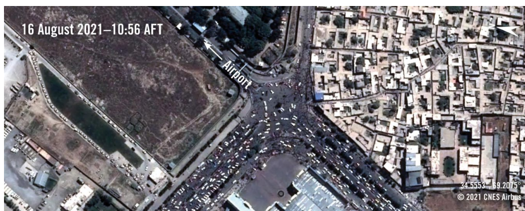
Kabul Airport vicinity. 16 August 2021.

In this report, Amnesty International, International Federation for Human Rights (FIDH) and the World Organisation against Torture (OMCT) have documented incidents of human rights violations that have taken place in Afghanistan since the takeover by the Taliban on 15 August. This report calls on the UN Human Rights Council (UNHRC) to take decisive action to establish a robust independent investigative mechanism to monitor and report on human rights abuses committed in violation of international human rights law, and to contribute to accountability for crimes under international law. Human rights defenders, journalists, and others who are targeted for their work must be evacuated and given safe passage if they wish to leave Afghanistan; and women and girls, and ethnic and religious minorities who are targeted because of their gender, ethnic, and religious identity, must be guaranteed protection. All those who wish to leave Afghanistan must be assured the right to seek asylum. At the same time, the Office of the Prosecutor of the International Criminal Court must receive assistance from the international community to immediately recommence its investigations into crimes under international law committed in Afghanistan.