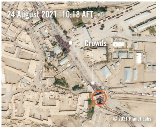
Spin Boldak-Chaman crossing. 24 August 2021.

For instance, according to UNHCR, Pakistan closed its border with Afghanistan, except for people in need of medical treatment, or with a proof of residency. 186 Despite that, at the Spin Boldak-Chaman border crossing in Kandahar, people with Tazkira (National ID Card) from Kandahar, Helmand, Zabul, and Uruzgan were allowed to cross the border. Between 2 August 2021 and 24 August 2021, the crowds attempting to cross the border to Pakistan via the Spin Boldak crossing increased exponentially, as documented via satellite imagery (see above) and video analysed by Amnesty International.