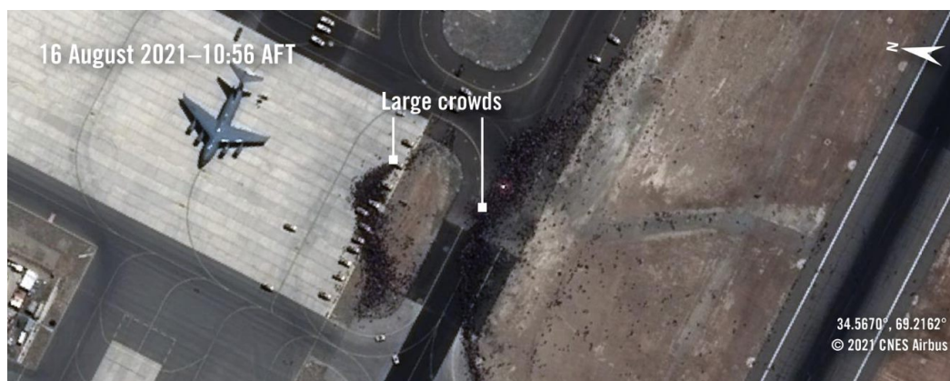
16 August 2021. Kabul Airport.

The thousands who are left behind, or are trying to leave Afghanistan, are testament to the brutal regime of the Taliban circa 2001, when extrajudicial executions abounded, and women and girls were oppressed with a plethora of restrictions. Since then, even in the last 20 years, the Taliban and other armed groups have conducted brutal attacks on civilians, journalists, human rights defenders, and government workers, resulting in Afghanistan having one of the highest civilian deaths in the world. 32 Nearly 50,000 civilians have died in the last 20 years. 33 The first half of 2021 alone recorded 5183 civilian casualties (1,659 deaths and 3,524 injuries), of which 32 per cent were children. This is a 47 per cent increase in civilian casualties compared to the same period in 2020. 34 Those responsible for these casualties include both anti-government and pro-government forces. 35