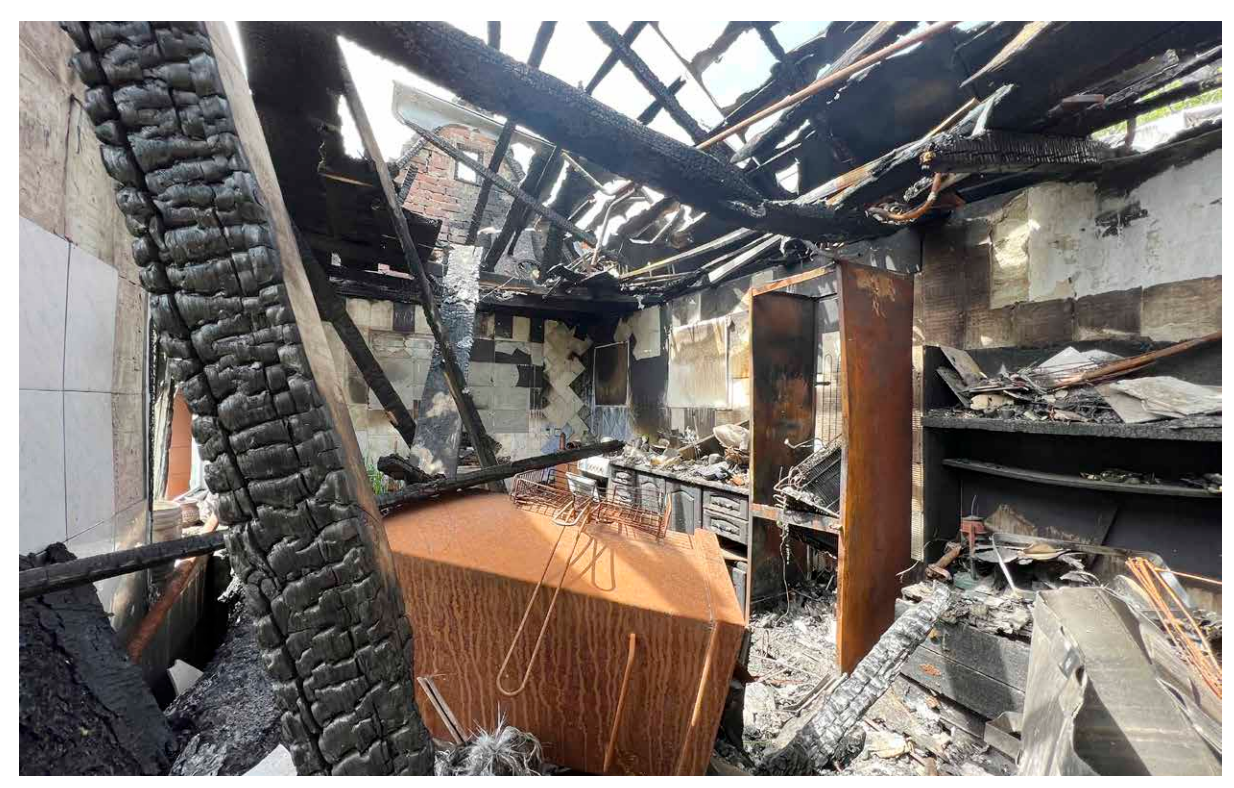
Serhii Tkachov's home after the rocket strike.

On the same day three other houses were struck in nearby streets, without causing any casualties as residents were either sheltering in the cellars or had left.