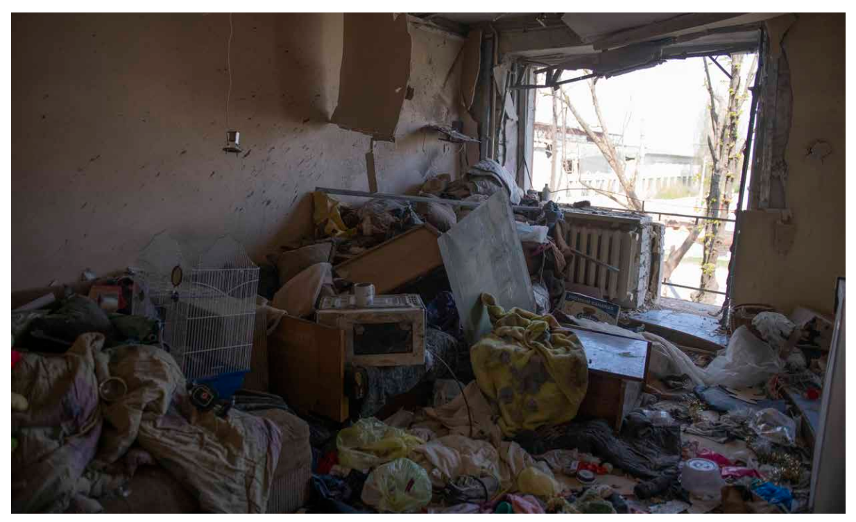
A destroyed apartment in a building in Nova Bavariya Avenue , where a multi-rocket strike killed at least seven civilians and injured more than 70 on 1 March.

Doctors at the nearby Municipal Hospital Number 3 told Amnesty International that they received 70 patients who were wounded in the blast, 20 of whom suffered severe injuries and 50 with moderate to light injuries. Doctors and local residents said that many of the wounded had been standing in line to receive humanitarian aid at a distribution point on the road.