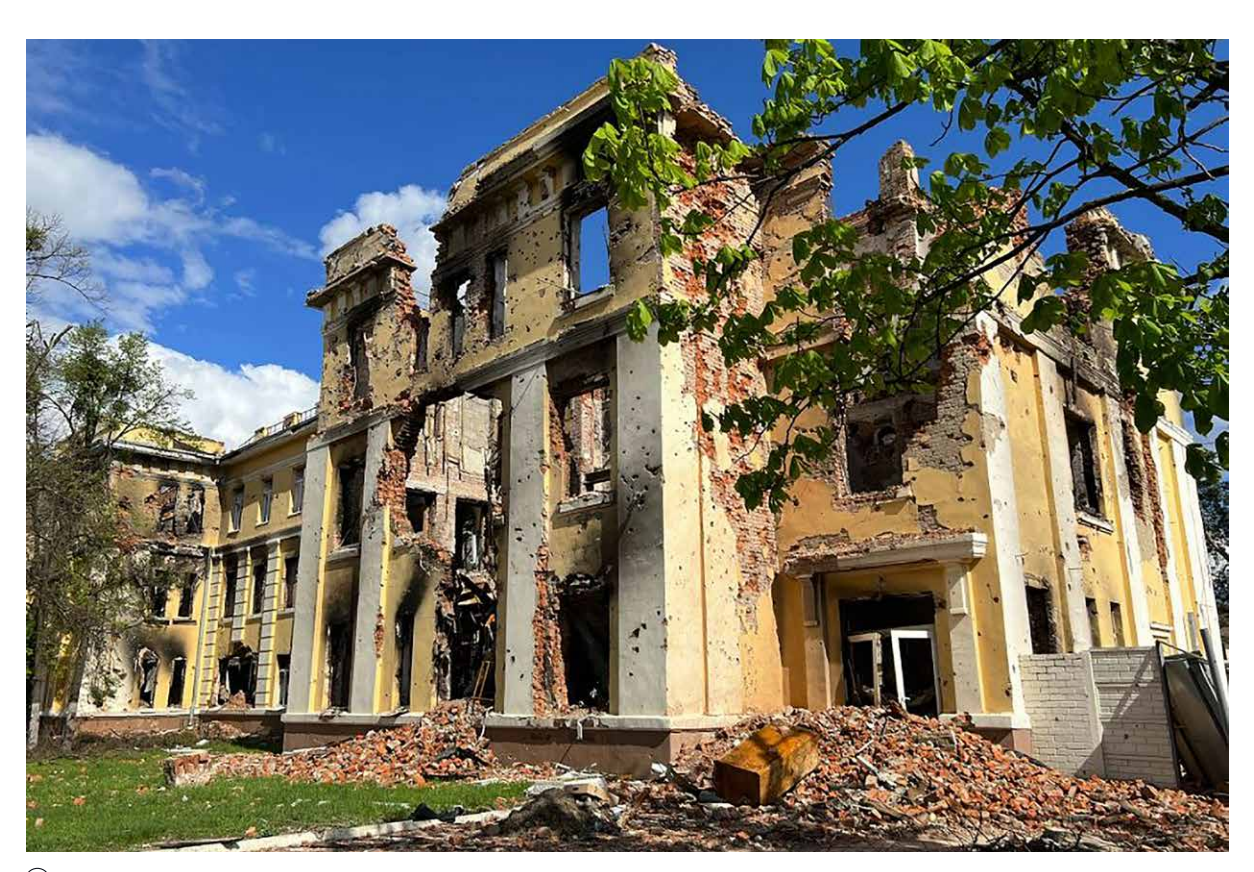
School 134, north-east of the city-centre, which was destroyed during fighting when Russian forces tried to invade the city at the end of February.