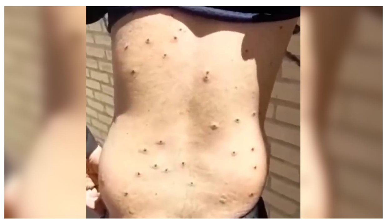
Screenshot taken from a video circulated online on 15 May 2022, showing the birdshot injuries sustained by a protester in Chelicheh. The video also shows injuries to his lower back and buttocks.