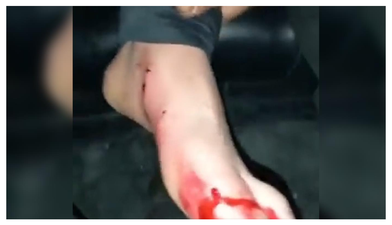
Screenshot taken from a video circulated online on 16 May 2022, showing the injuries sustained by a child during the crackdown of protests in Chaharmahal and Bakhtiari province.

"This is the work of the police [officials from the Law Enforcement Command of the Islamic Republic of Iran (known by its Persian acronym Faraja )] and the Basij [a paramilitary volunteer militia operating under the Islamic Revolutionary Guards Corps] in Chaharmahal and Bakhtiari. They did not even show mercy to a seven [or] eight-year-old-child."