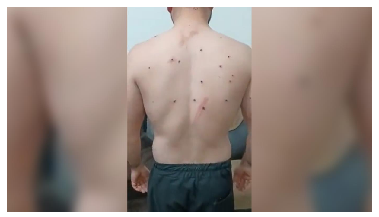
Screenshot taken from a video circulated online on 15 May 2022, showing the birdshot injuries sustained by a protester in Shahrekord. The video also shows injuries to his head.

Two videos, which circulated online on 15 May 2022 and which the persons filming say were from Shahrekord and Chelicheh, show classic spray patterns of birdshot wounds to the backs, buttocks and/or heads of those injured.<sup>33</sup>