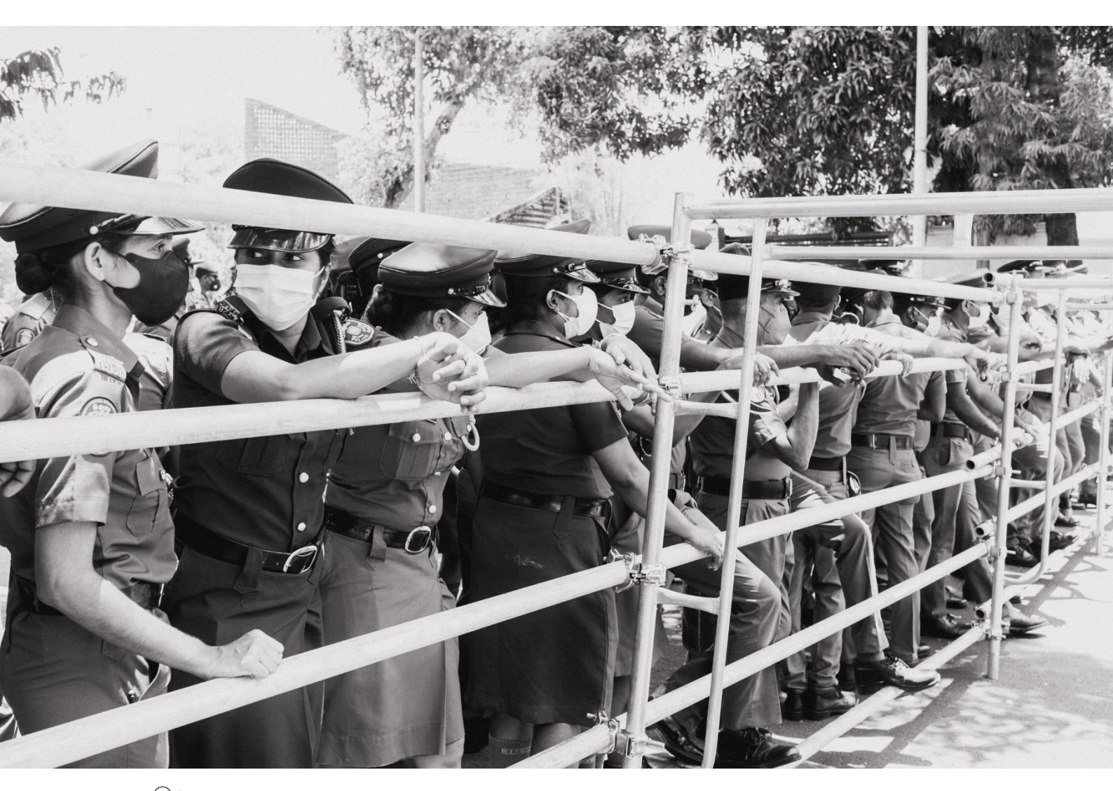
● ↑ Police reinforce a steel barricade preventing protesters from accessing Independence Square to protest at Independence Avenue in Colombo, on 03 April 2022.