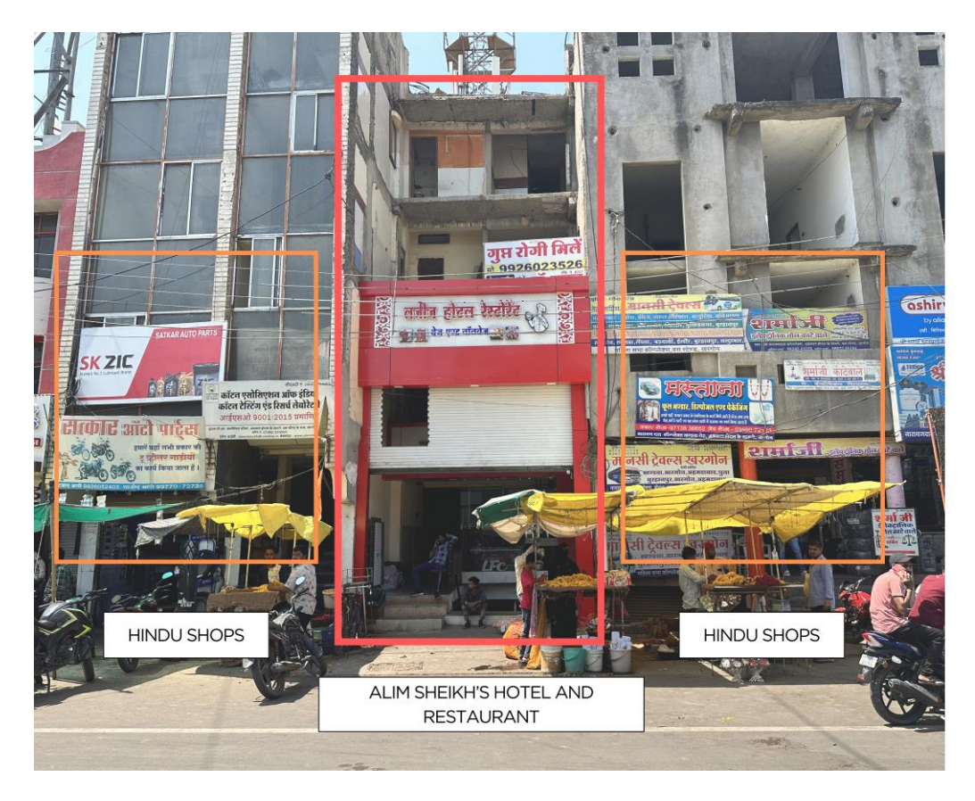
Khargone, Madhya Pradesh: Alim Sheikh's hotel and restaurant was the only shop to be demolished while the neighbouring Hindu shops were left untouched.

In one such emblematic case, in Khargone, Madhya Pradesh, the front façade of Alim Sheikh's restaurant and travel lodge, the Laziz Hotel, was demolished by the authorities. During the demolitions, the authorities alleged the building was encroaching on public land. Amnesty International visited the area near his hotel, and found it is surrounded by similar sized shops owned by Hindus. None of those properties had faced any adverse action from the municipal authorities.