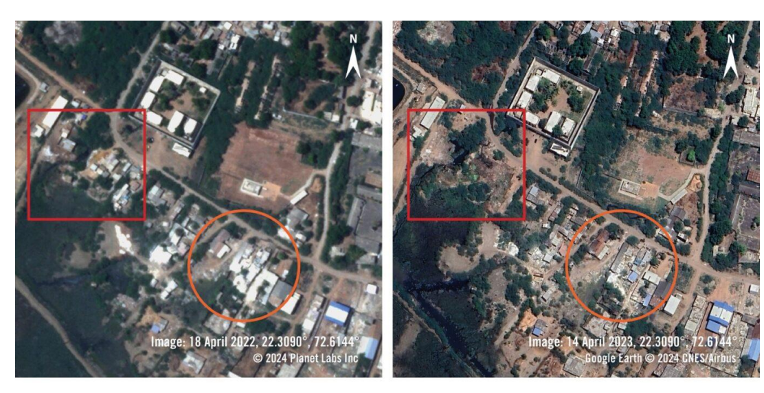
Khambhat, Gujarat: Satellite imagery from 14 April 2022, shows the 19 warehouses (highlighted in red box) and Hindu-populated area of Macchipiura (highlighted in orange circle) before the event. On 18 April 2022, the warehouses appear destroyed while Macchipura remains untouched.

"If our businesses are indeed illegal, why not also demolish the businesses run by Hindus right next to us? It is as if [the government] doesn't want us Muslims to rise, to do good business, to develop. They want to break our spirit." 139