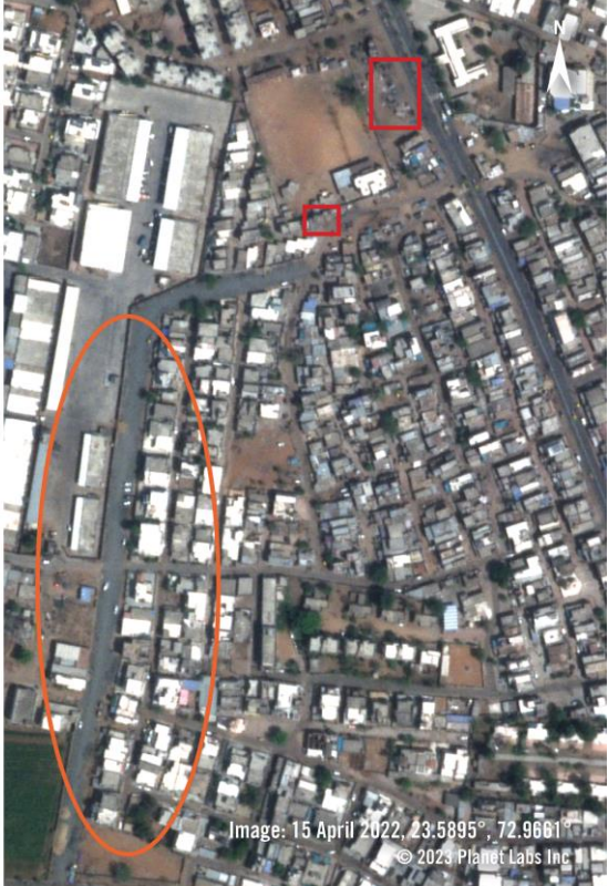
Himmatnagar, Gujarat: Satellite imagery from 29 March 2022, shows the Muslim shops (highlighted in red boxes) and Hindu houses (highlighted in orange circles) along the road. On 15 April 2022, the Muslim shops appear destroyed while the Hindu houses stand erect.

In Jahangirpuri, Delhi, Amnesty International documented the demolition of at least 25 businesses, including costermongers. <sup>142</sup> Amnesty International also found that Kushal Road, where both a mosque and temple were situated, were mostly populated by Muslim shops. While the front façade of the mosque and shops