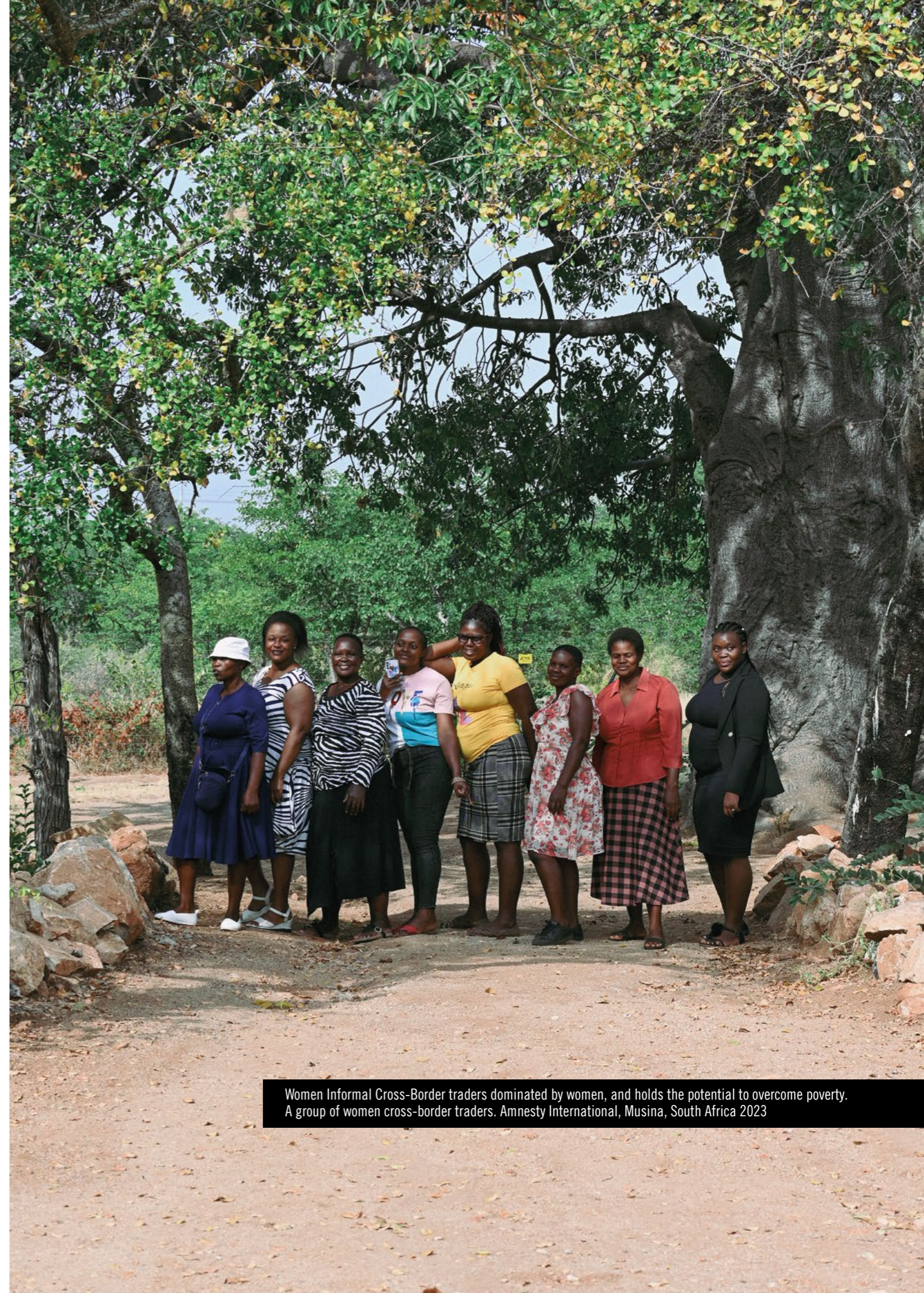
Women Informal Cross-Border traders dominated by women, and holds the potential to overcome poverty. A group of women cross-border traders. Amnesty International, Musina, South Africa 2023