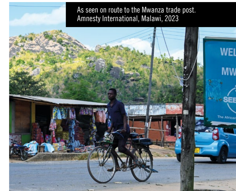
As seen on route to the Mwanza trade post. Amnesty International, Malawi, 2023

the urgent need for sweeping reforms aimed at building inclusive social protection systems that are responsive to the diverse needs of all individuals, particularly vulnerable populations such as women engaged in the informal sector. In addition to this and compounding matters, women in informal cross-border trade also face a heavy care burden, contributing to significant "time poverty" and impacting their physical and mental well-being. Health challenges, including stress, anxiety, and reproductive concerns, are prevalent among women traders, aggravated by limited access to healthcare due to high mobility.