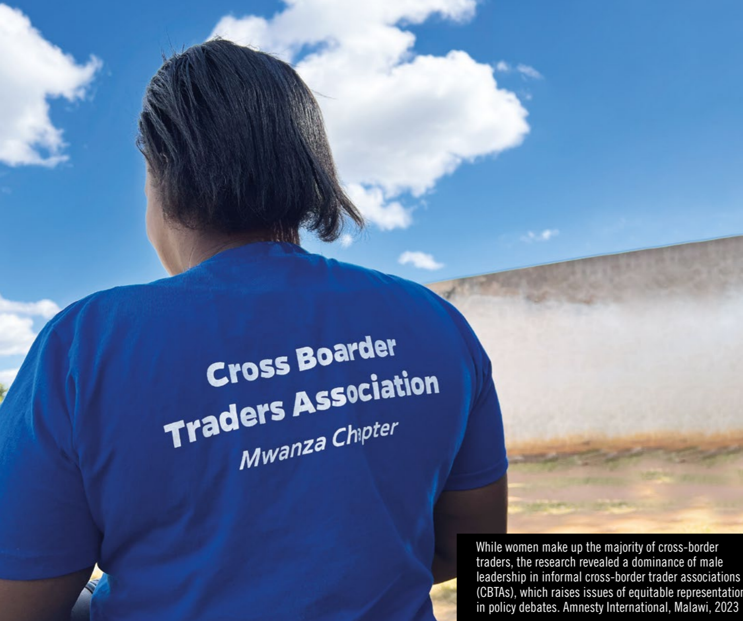
While women make up the majority of cross-border traders, the research revealed a dominance of male leadership in informal cross-border trader associations (CBTAs), which raises issues of equitable representation in policy debates. Amnesty International, Malawi, 2023