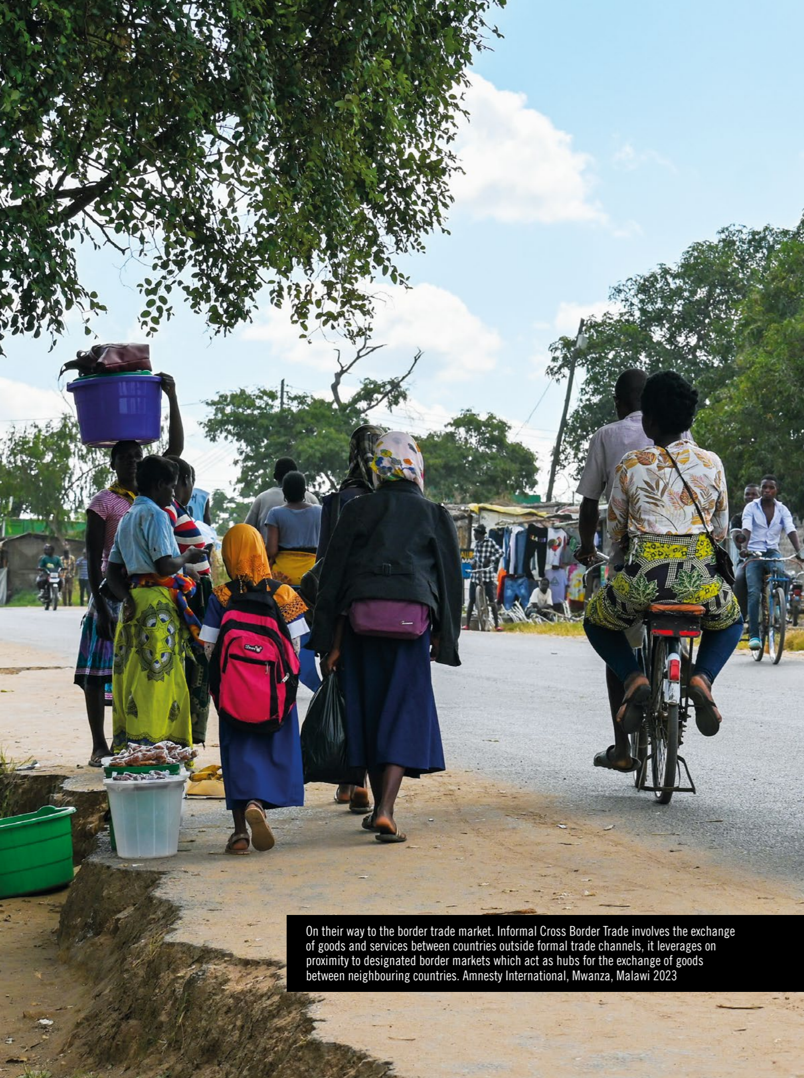
On their way to the border trade market. Informal Cross Border Trade involves the exchange of goods and services between countries outside formal trade channels, it leverages on proximity to designated border markets which act as hubs for the exchange of goods between neighbouring countries. Amnesty International, Mwanza, Malawi 2023