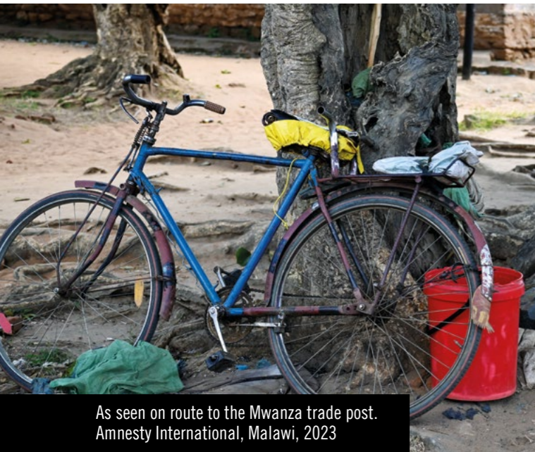
As seen on route to the Mwanza trade post. Amnesty International, Malawi, 2023

Amnesty International's research reveals that women engaged in informal cross-border trade experience alarming rates of gender-based violence, spanning economic, sexual, and physical abuse. This infringes upon their right to security and hampers their enjoyment of other fundamental human rights, including the right to decent work. Despite international mandates for gender equality and protection against discrimination in the workplace, women in informal cross-border trade remain vulnerable to various forms of discrimination and violence, often perpetrated by both state and non-state actors. State agents, such as border officials, are reported to be among the perpetrators, subjecting women to harassment, intrusive searches, and even sexual exploitation.