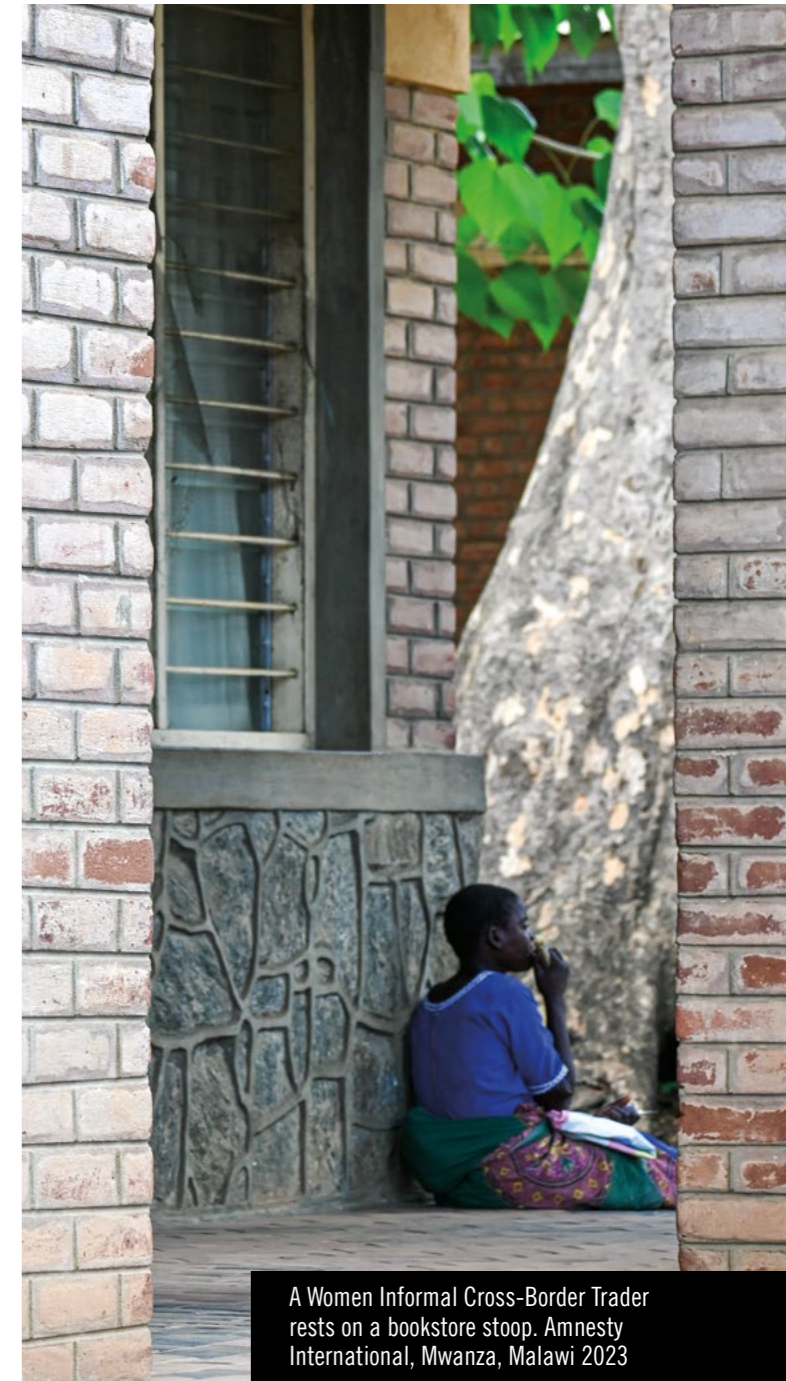
A Women Informal Cross-Border Trader rests on a bookstore stoop. Amnesty International, Mwanza, Malawi 2023

The human rights framework governing informal cross-border trade in Southern Africa encompasses key international instruments focused on the rights of women and the right to work. The Universal Declaration of Human Rights (UDHR), Convention on the Elimination of All Forms of Discrimination Against Women (CEDAW), and the Maputo Protocol, among others, highlight commitments made by Malawi, Zambia, and Zimbabwe in addressing gender-based discrimination and promoting economic, social, and cultural rights. The right to work, outlined in various instruments such as the International Covenant on Economic, Social and Cultural Rights (ICESCR) and the Banjul Charter, reflects commitments to fostering lawful economic activities. The ILO Decent Work Framework, although not legally binding, aligns with broader international commitments and principles, emphasizing fair, inclusive, and dignified labour practices for all workers, including those in the informal sector. Despite variations in country contexts, the analysis of informal cross-border trade reveals a consistent pattern of human rights violations faced by women across the region, emphasizing the need for a comprehensive human rights approach to address key violations.